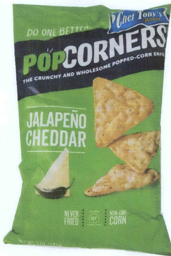
Figure 2. Unregistered CHEF TONY'S SNACK CO. POPCORNERS, JALAPEÑO CHEDDAR