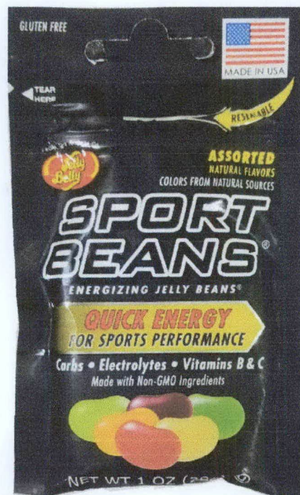
Figure 4. Unregistered JELLY BELLY SPORT BEANS, Assorted Natural Flavors