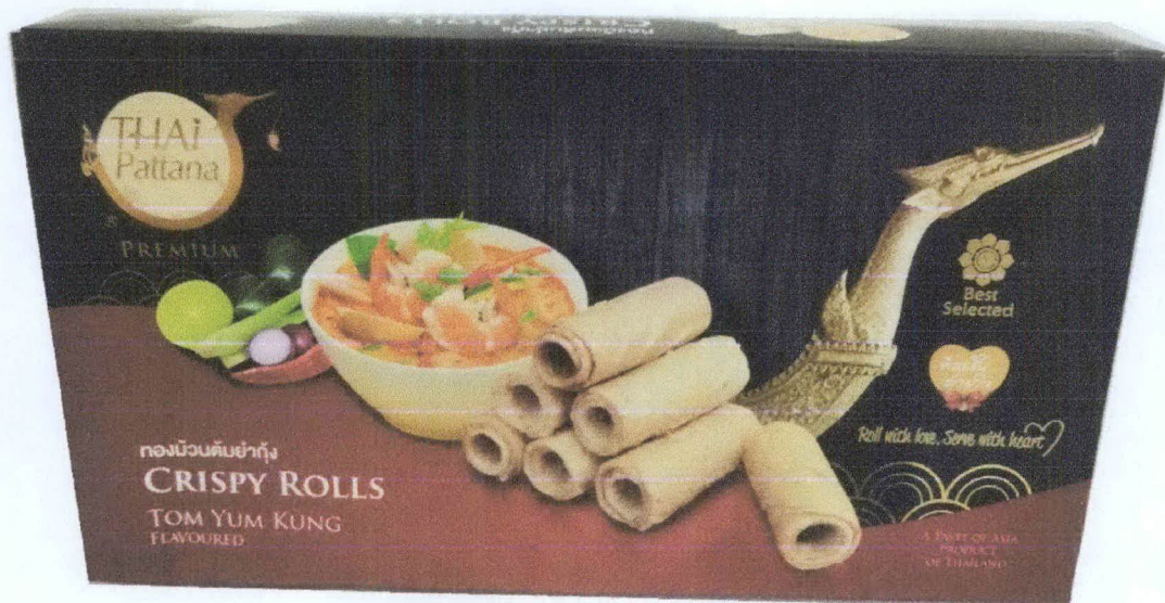
Figure 6. Unregistered THAI PATTANA Premium Crispy Rolls, Tom Yum Kung Flavoured

FDA post-marketing surveillance (PMS) activities have verified that the abovementioned food products have not gone through the registration process of the agency and have not been issued the proper authorization in the form of Certificate of Product Registration. Pursuant to Republic Act No. 9711, otherwise known as the “Food and Drug Administration Act of 2009”, the manufacture, importation, exportation, sale, offering for sale, distribution, transfer, non-consumer use, promotion, advertising or sponsorship of health products without the proper authorization from FDA is prohibited.