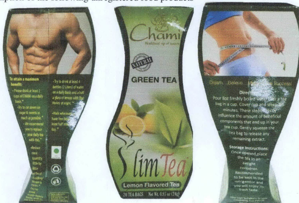
Figure 1. Unregistered CHAMI Natural Green Tea Slim Tea, Lemon Flavored Tea

The Food and Drug Administration (FDA) advises the public against the purchase and consumption of the following unregistered food products: