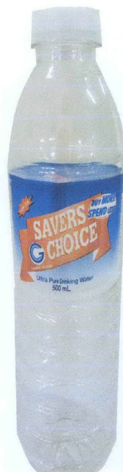
Figure 5. Unregistered SAVERS CHOICE Ultra Pure Drinking Water