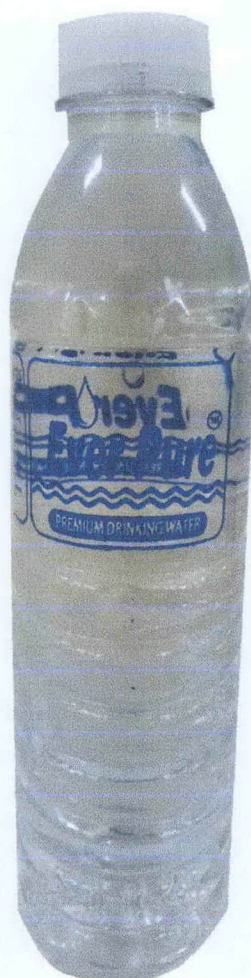
Figure 4. Unregistered EVER PURE Premium Drinking Water