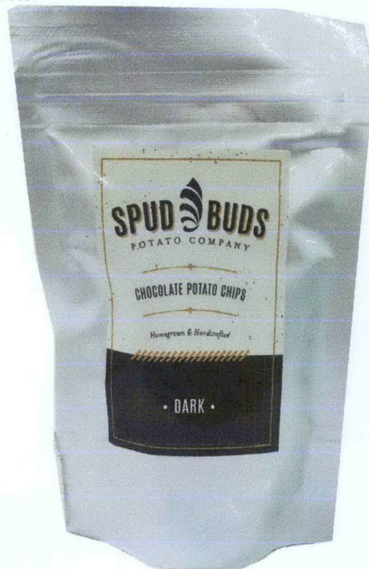
Figure 2. Unregistered SPUD BUDS POTATO COMPANY Chocolate Potato Chips