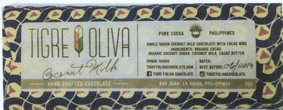
Figure 5. Unregistered TIGRE OLIVA Coconut Milk Hand Crafted Chocolate