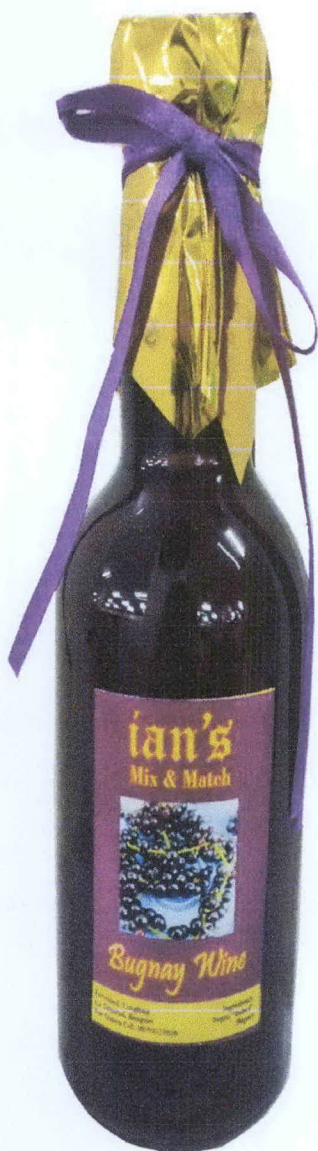
Figure 3. Unregistered IAN'S Mix & Match Bugnay Wine