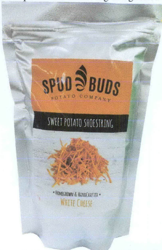
Figure 1. Unregistered SPUD BUDS POTATO COMPANY Sweet Potato Shoestring

The Food and Drug Administration (FDA) advises the public against the purchase and consumption of the following unregistered food products: