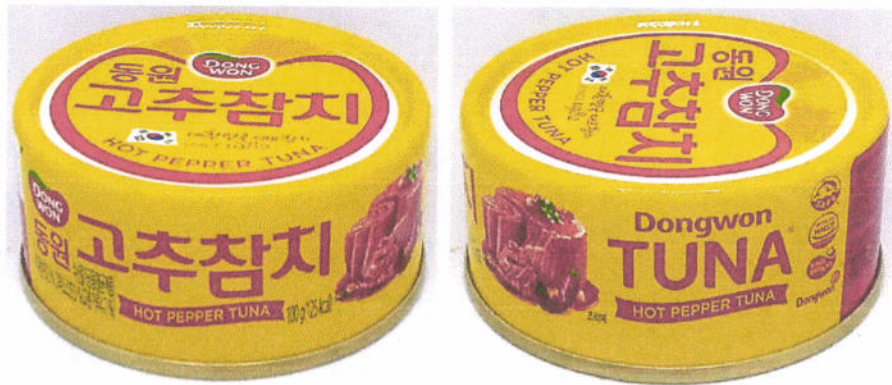
Figure 3. Unregistered Dong Won Hot Pepper Tuna