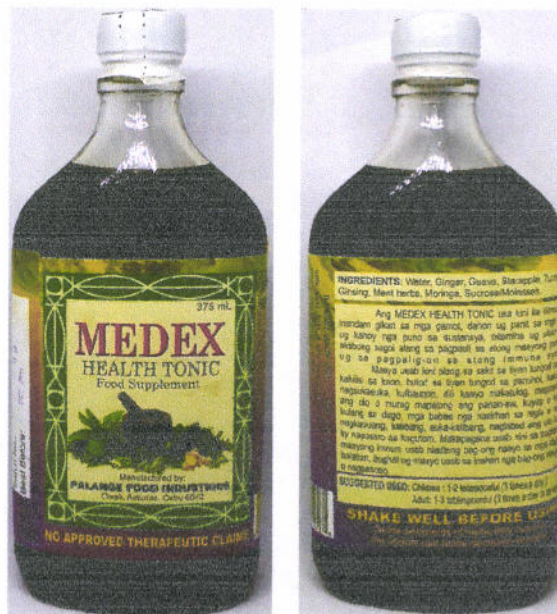
Figure 5. Unregistered MEDEX Health Tonic Food Supplement

FDA post-marketing surveillance (PMS) activities have verified that the abovementioned food supplements and food products have not gone through the registration process of the agency and have not been issued the proper authorization in the form of Certificate of Product Registration. Pursuant to Republic Act No. 9711, otherwise known as the “Food and Drug Administration Act of 2009”, the manufacture, importation, exportation, sale, offering for sale, distribution, transfer, non-consumer use, promotion, advertising or sponsorship of health products without the proper authorization from FDA are prohibited.