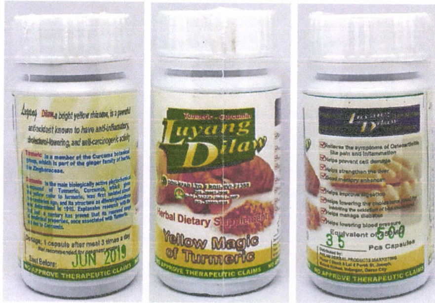
Figure 2. Unregistered Luyang Dilaw Herbal Dietary Supplement