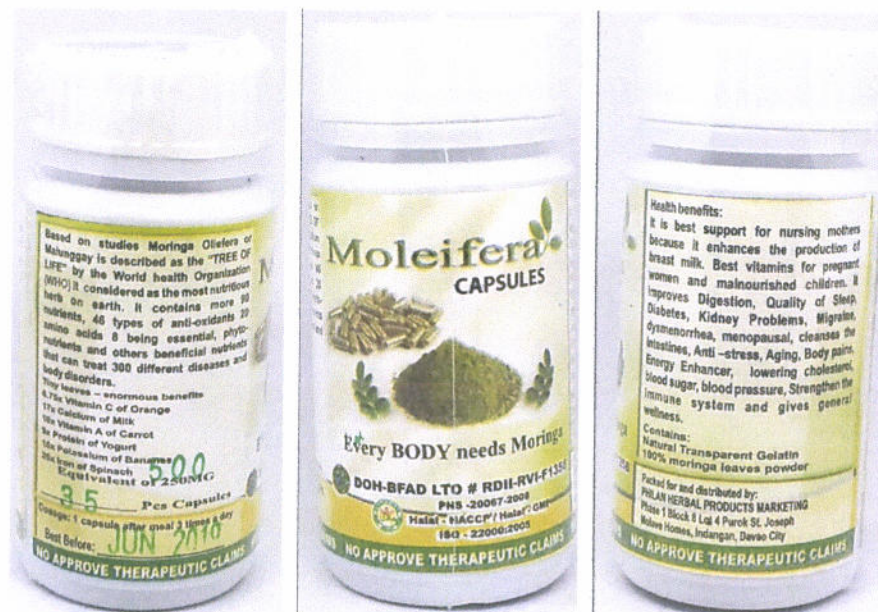
Figure 1. Unregistered Moleifera Capsules

The Food and Drug Administration (FDA) advises the public against the purchase and consumption of the following unregistered food supplements and food products: