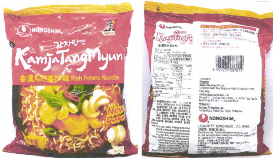
Figure 4. Unregistered NONGSHIM KamjaTangMyun Rich Potato Noodle