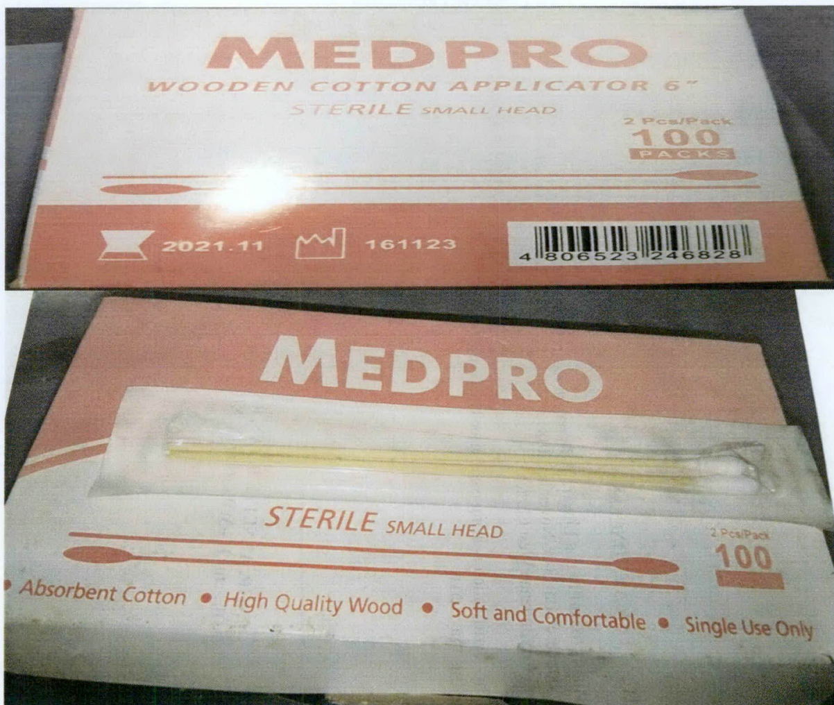
Figure1. Images of MEDPRO Wooden Cotton Applicator

The Food and Drug Administration (FDA) advises the general public and all healthcare professionals, establishment and general consuming public against the purchase and use of the unregistered medical device MEDPRO Wooden Cotton Applicator :