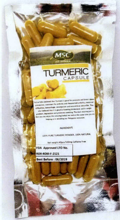
Figure 6. Unregistered MSC Turmeric Capsule

FDA post-marketing surveillance (PMS) activities have verified that the abovementioned food products and food supplements have not gone through the registration process of the agency and have not been issued the proper authorization in the form of Certificate of Product Registration. Pursuant to Republic Act No. 9711, otherwise known as the “Food and Drug Administration Act of 2009”, the manufacture, importation, exportation, sale, offering for sale, distribution, transfer, non-consumer use, promotion, advertising or sponsorship of health products without the proper authorization from FDA are prohibited.