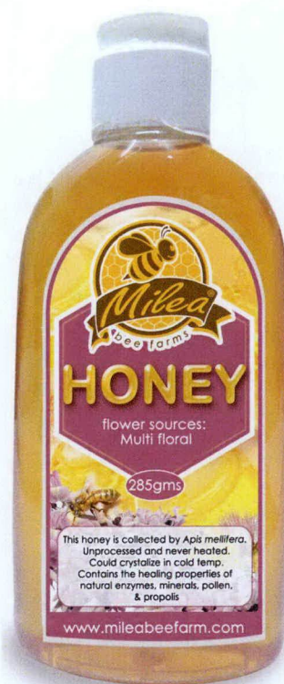
Figure 2. Unregistered MILEA BEE FARM Honey