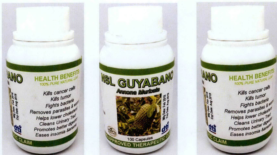
Figure 4. Unregistered NSL Guyabano Annona Muricata