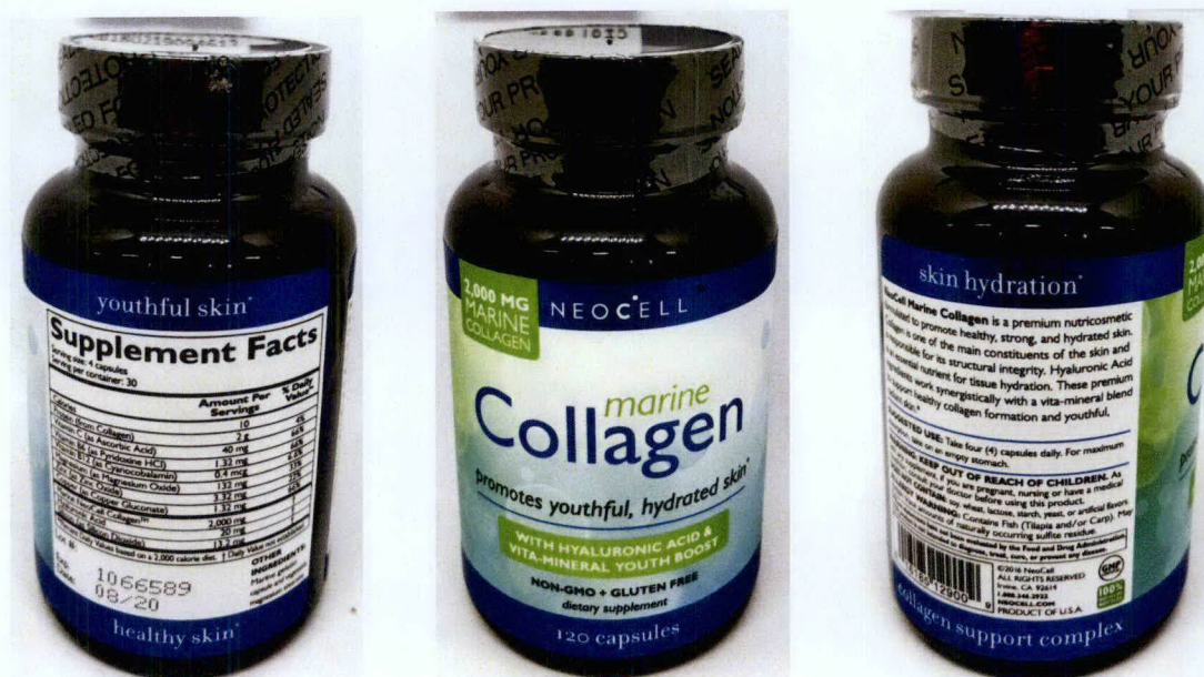
Figure 1. Unregistered NEOCELL Marine Collagen with Hyaluronic Acid & Vita-Mineral Youth Boost

The Food and Drug Administration (FDA) advises the public against the purchase and consumption of the following unregistered food products and food supplements: