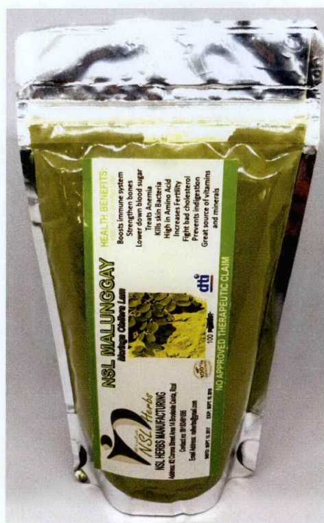
Figure 5. Unregistered NSL Malunggay Moringa Oleifera Lam