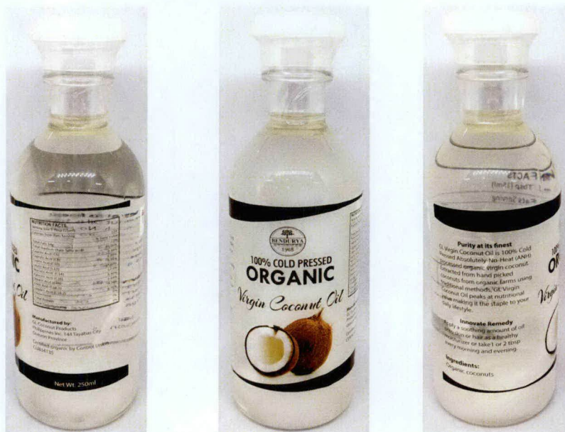
Figure 3. Unregistered BENDURYA 100% Cold Pressed Organic Virgin Coconut Oil