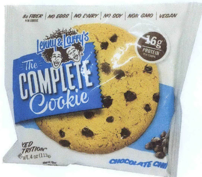
Figure 5. Unregistered LENNY & LARRY'S The Complete Cookie, Chocolate Chip

FDA post-marketing surveillance (PMS) activities have verified that the abovementioned food products have not gone through the registration process of the agency and have not been issued the proper authorization in the form of Certificate of Product Registration. Pursuant to Republic