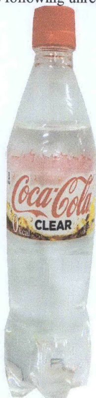
Figure 1. Unregistered COCA-COLA Clear, 0 Kcal

The Food and Drug Administration (FDA) advises the public against the purchase and consumption of the following unregistered food products: