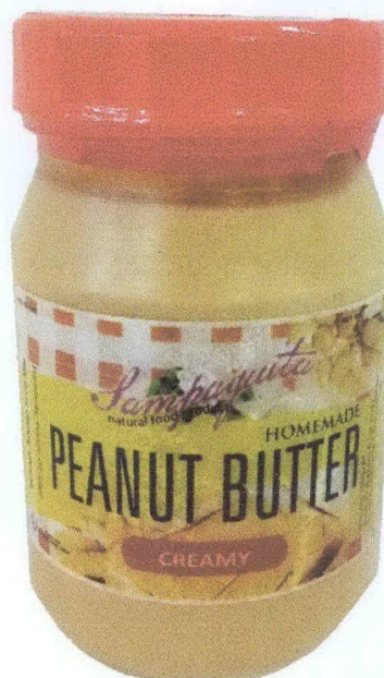
Figure 2. Unregistered SAMPAGUITA Homemade Peanut Butter