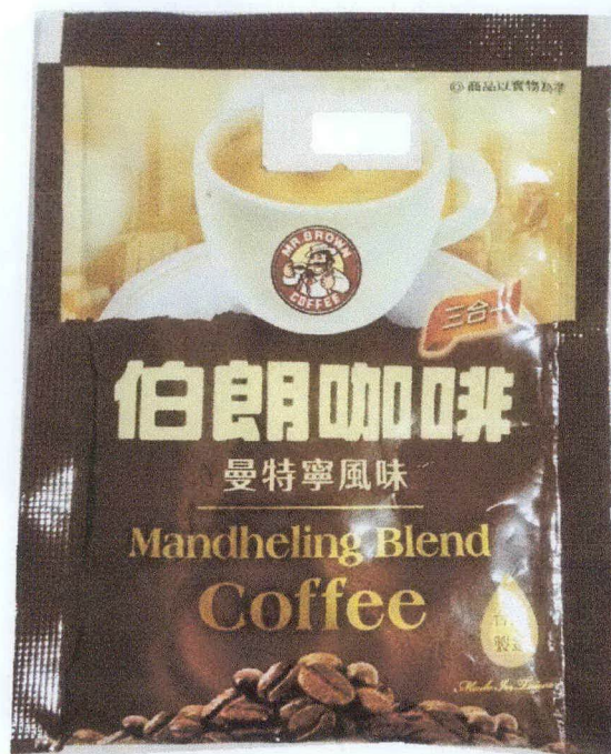
Figure 3. Unregistered MR. BROWN COFFEE Mandheling Blend Coffee