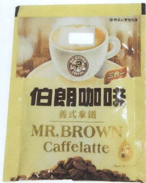
Figure 4. Unregistered MR. BROWN COFFEE Coffee Caffelatte