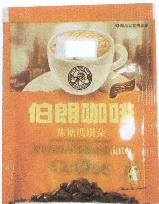
Figure 2. Unregistered MR. BROWN COFFEE Caramel Macchiato Coffee