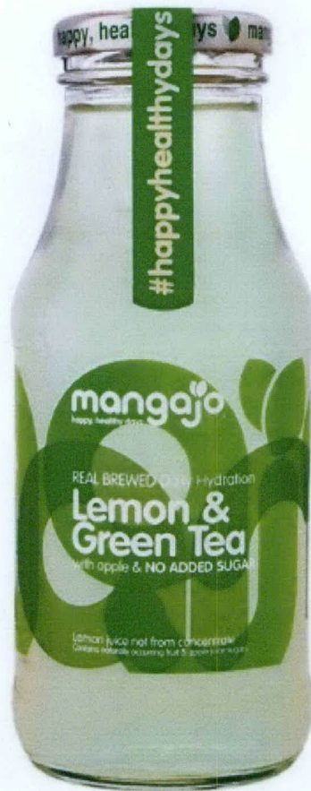
Figure 4. Unregistered Mangajo Lemon & Green Tea

FDA post-marketing surveillance (PMS) activities have verified that the abovementioned food products have not gone through the registration process of the agency and have not been issued the proper authorization in the form of Certificate of Product Registration. Pursuant to Republic Act No. 9711, otherwise known as the “Food and Drug Administration Act of 2009”, the manufacture, importation, exportation, sale, offering for sale, distribution, transfer, non-consumer use, promotion, advertising or sponsorship of health products without the proper authorization from FDA is prohibited.