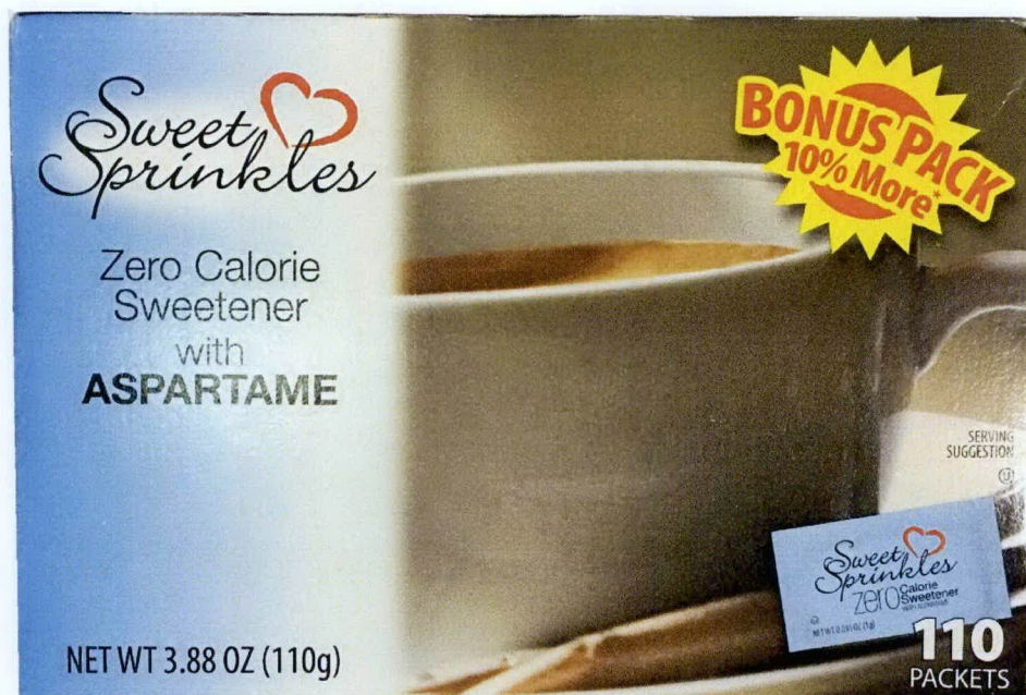
Figure 3. Unregistered SWEET SPRINKLES Zero Calorie with Aspartame