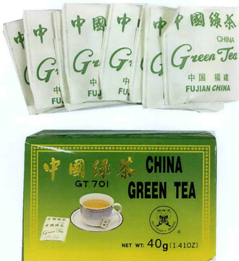
Figure 2. Unregistered China Green Tea (THE VERT DE CHINE)