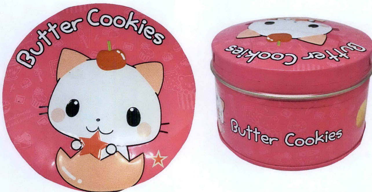
Figure 1. Unregistered Butter Cookies

The Food and Drug Administration (FDA) advises the public against the purchase and consumption of the following unregistered food products: