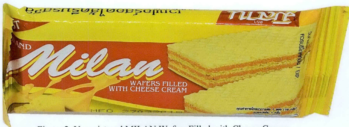
Figure 2. Unregistered MILAN Wafers Filled with Cheese Cream