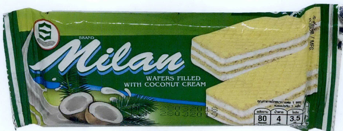
Figure 4. Unregistered MILAN Wafers Filled With Coconut Cream