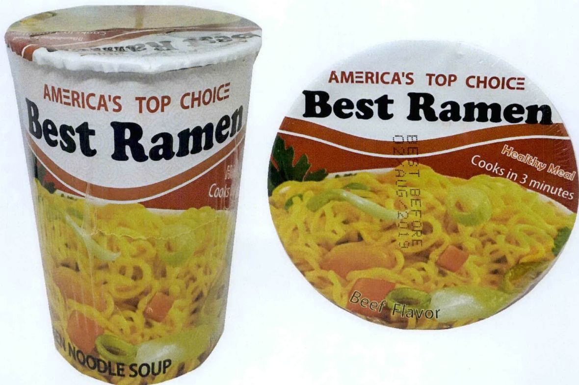
Figure 1. Unregistered AMERICA'S TOP CHOICE Best Ramen Beef Flavor

The Food and Drug Administration (FDA) advises the public against the purchase and consumption of the following unregistered food products: