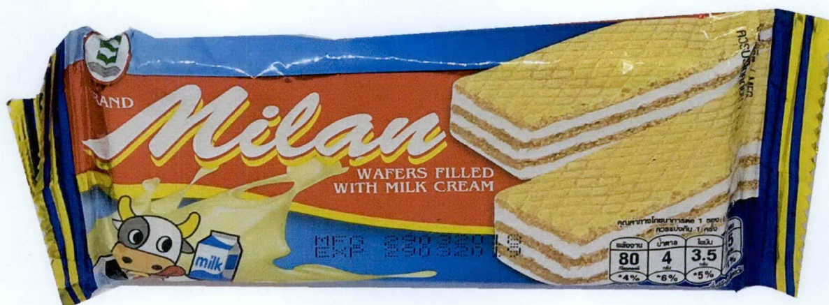
Figure 3. Unregistered MILAN Wafers Filled with Milk Cream