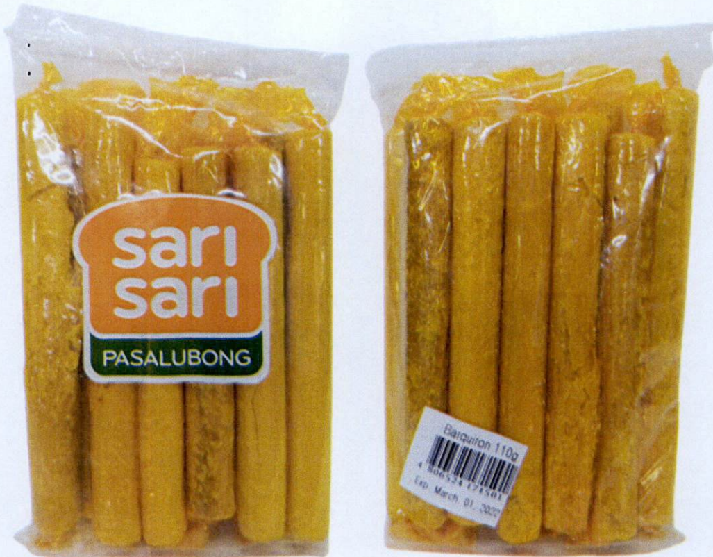
Figure 4. Unregistered SARI SARI PASALUBONG Barquiron