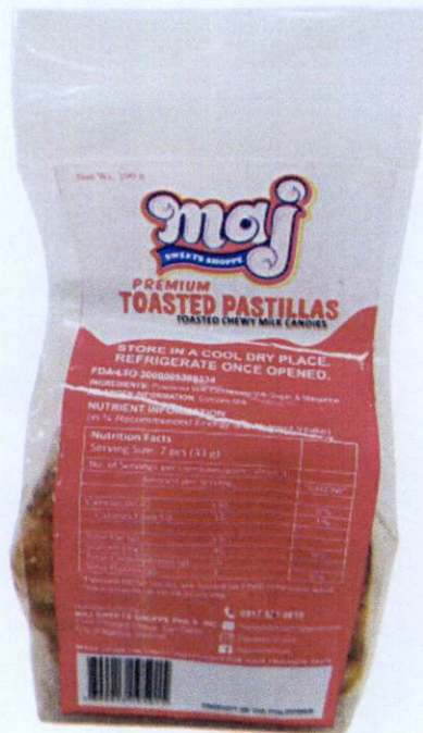
Figure 1. Unregistered MAJ SWEETS SHOPPE Premium Toasted Pastillas Toasted Chewy Milk Candies

The Food and Drug Administration (FDA) warns all healthcare professionals and the general public NOT TO PURCHASE AND CONSUME the following unregistered food products: