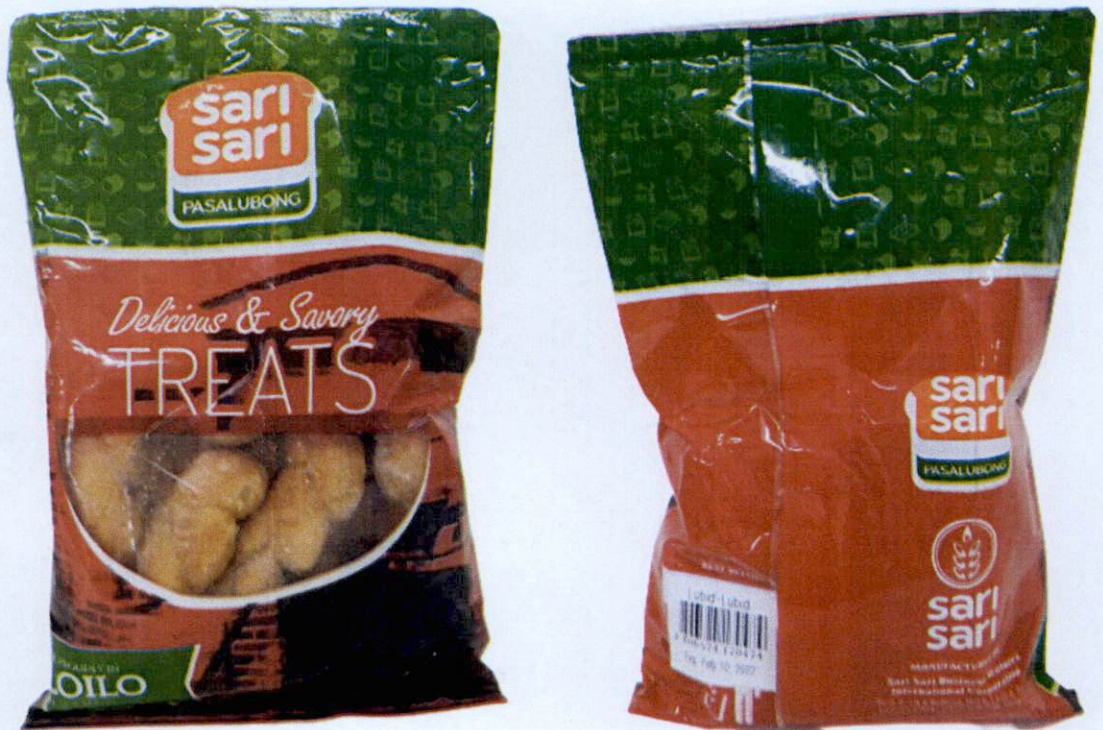
Figure 3. Unregistered SARI SARI PASALUBONG Delicious & Savory Treats Lubid-Lubid