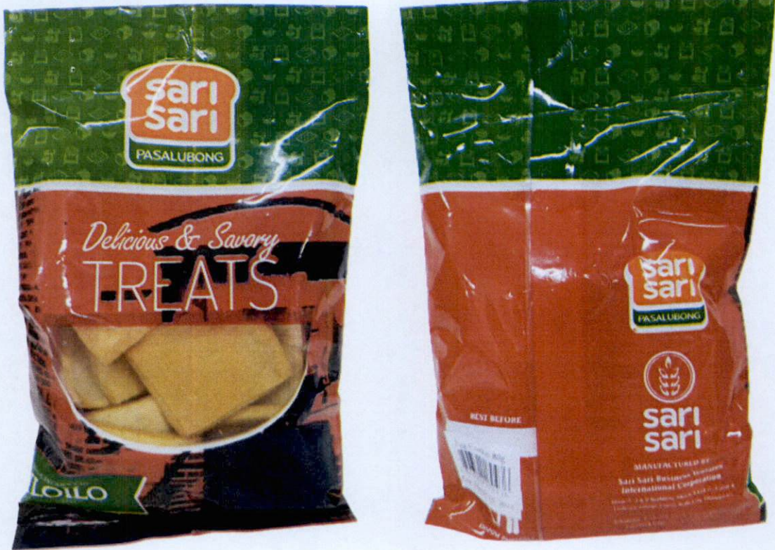
Figure 2. Unregistered SARI SARI PASALUBONG Delicious & Savory Treats Egg Cracker