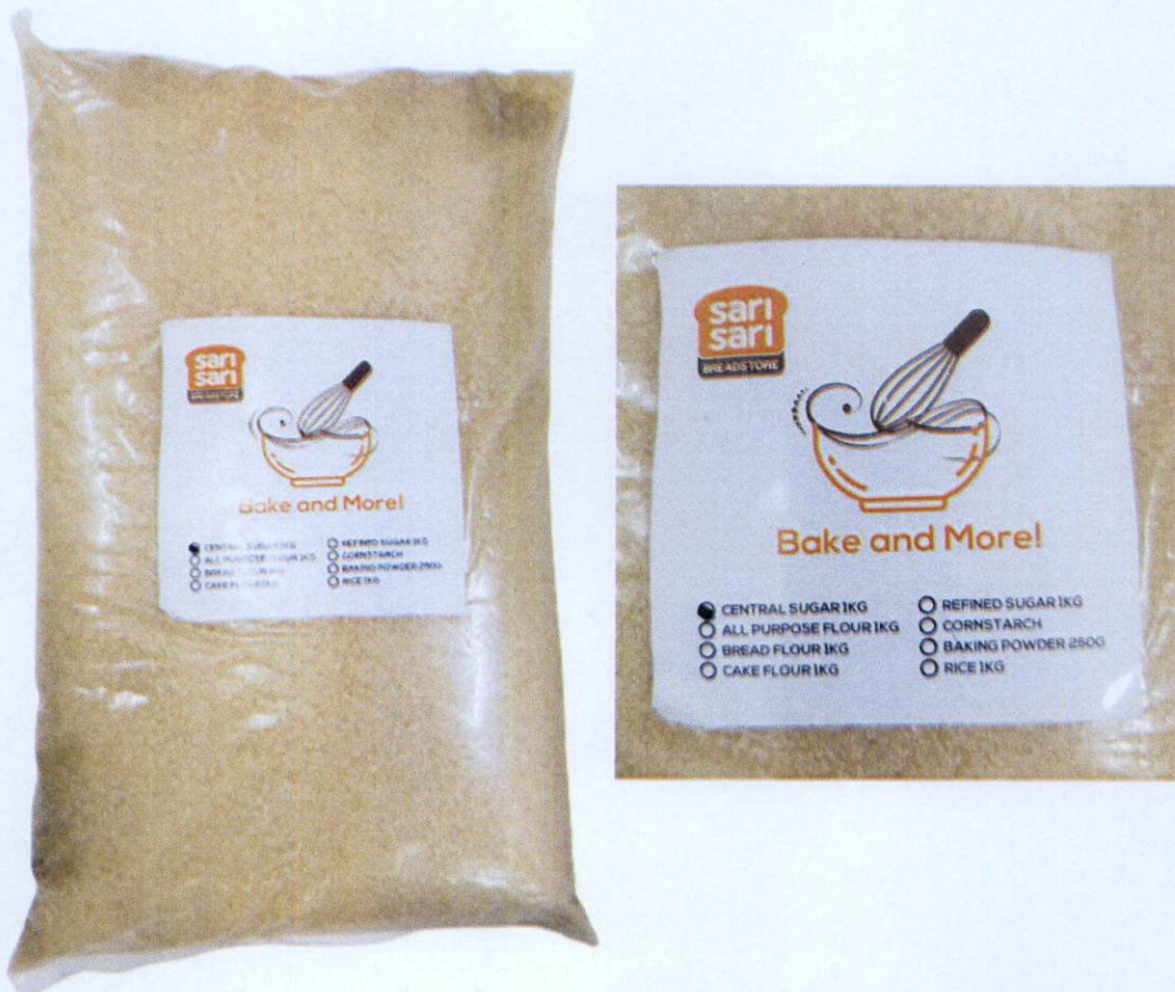
Figure 5. Unregistered SARI SARI BREADSTORE Central Sugar