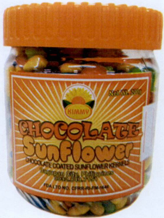
Figure 3. Unregistered KIMMY Chocolate Sunflower Chocolate Coated Sunflower Kernels