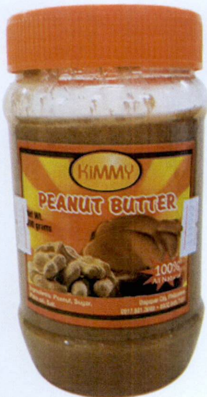
Figure 4. Unregistered KIMMY Peanut Butter