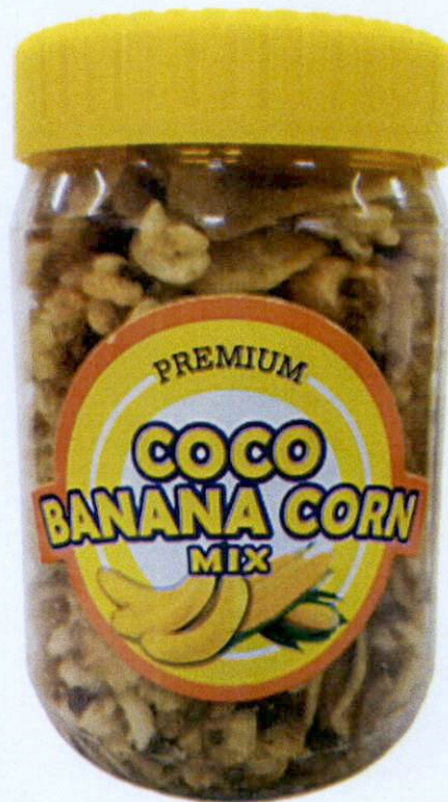
Figure 1. Unregistered PREMIUM COCO Banana Corn Mix

The Food and Drug Administration (FDA) warns all healthcare professionals and the general public NOT TO PURCHASE AND CONSUME the following unregistered food products: