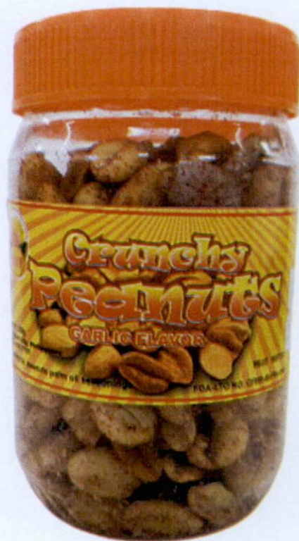
Figure 5. Unregistered KIMMY Crunchy Peanuts Garlic Flavor