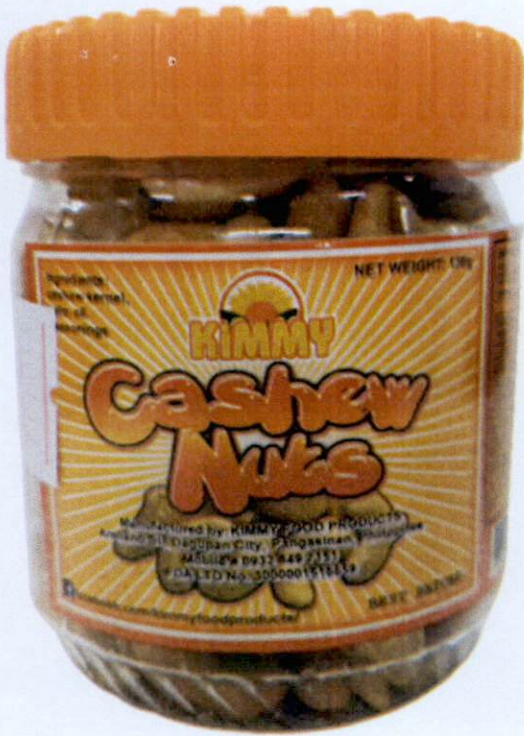
Figure 2. Unregistered KIMMY Cashew Nuts