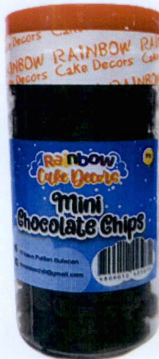
Figure 1. Unregistered RAINBOW CAKE DECORS Mini Chocolate Chips

The Food and Drug Administration (FDA) warns all healthcare professionals and the general public NOT TO PURCHASE AND CONSUME the following unregistered food products: