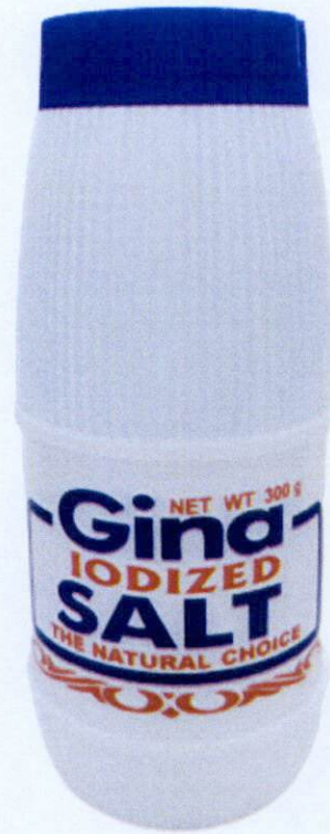
Figure 3. Unregistered GINA Iodized Salt The Natural Choice