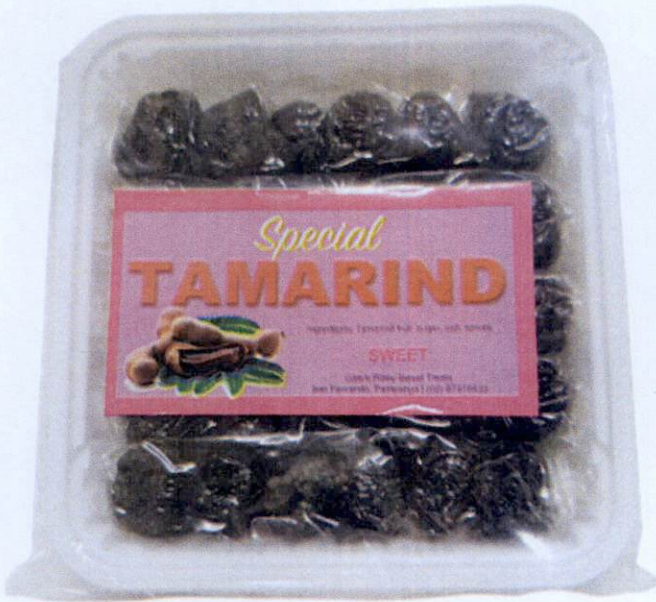
Figure 2. Unregistered COLE'S PINOY SWEET TREATS Special Tamarind Sweet