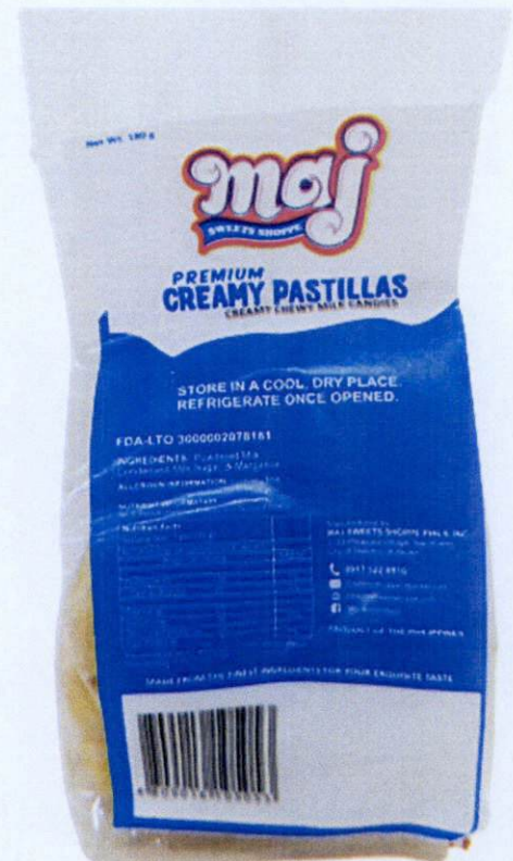
Figure 5. Unregistered MAJ SWEETS SHOPPE Premium Creamy Pastillas Creamy Chewy Milk Candies