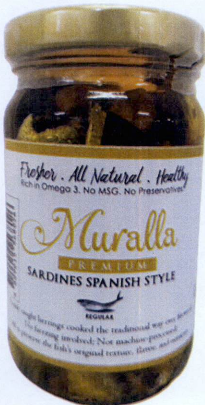
Figure 4. Unregistered MURALLA Premium Sardines Spanish Style