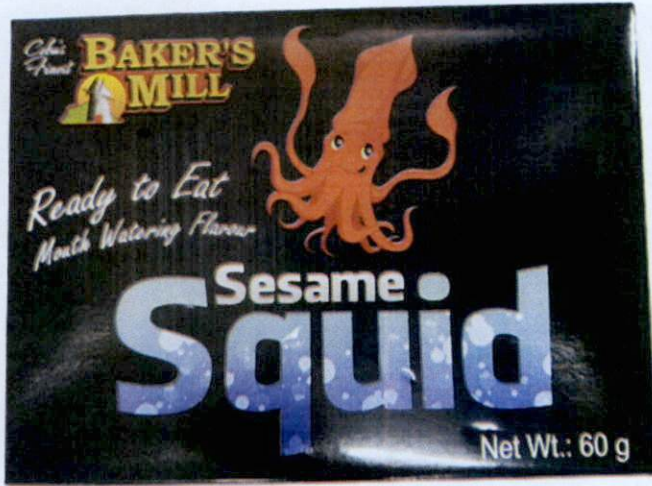
Figure 2. Unregistered BAKER'S MILL Sesame Squid