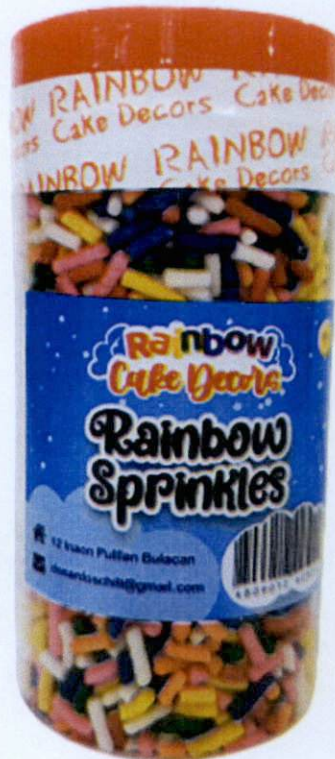
Figure 5. Unregistered RAINBOW CAKE DECORS Rainbow Sprinkles