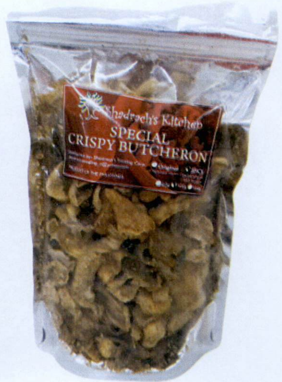
Figure 3. Unregistered SHADRACH'S KITCHEN Special Crispy Butcheron Spicy