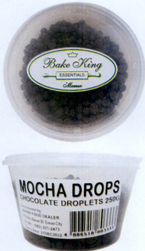
Figure 4. Unregistered MEMER BAKE KING ESSENTIALS Mocha Drops Chocolate Droplets