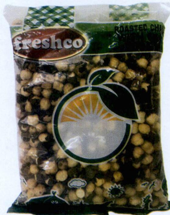
Figure 1. Unregistered FRESHCO Roasted Chana with Skin

The Food and Drug Administration (FDA) warns all healthcare professionals and the general public NOT TO PURCHASE AND CONSUME the following unregistered food products: