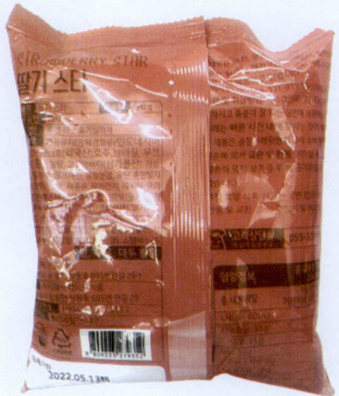
Figure 3. Unregistered Strawberry Star in Pink Packaging (In Foreign Language)