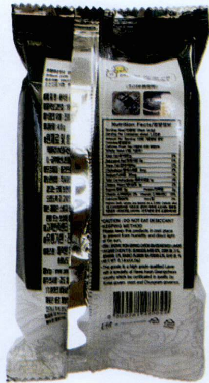
Figure 2. Unregistered Seasoned Laver in Green Packaging (In Foreign Language)