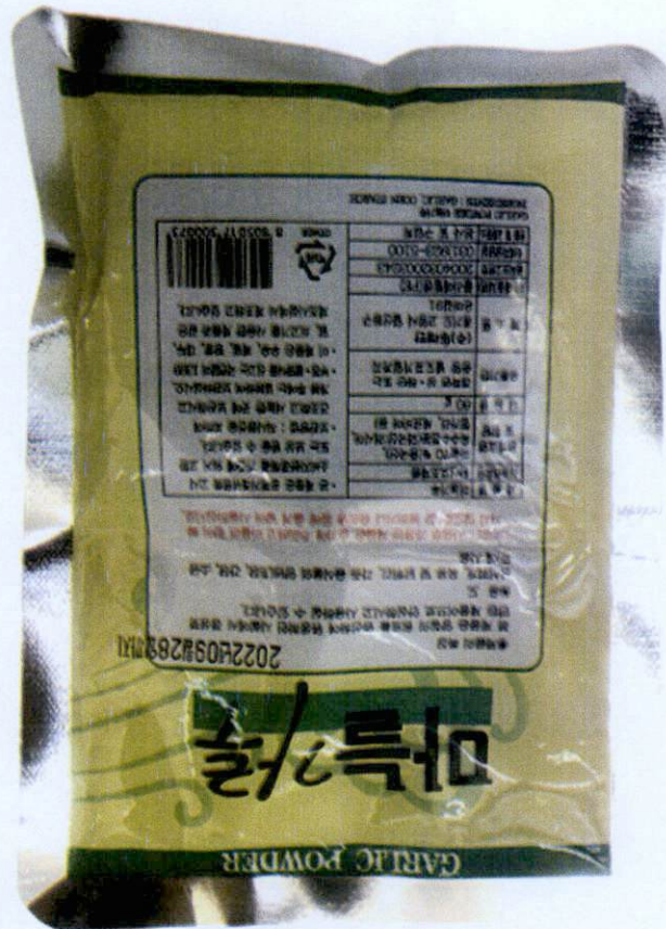
Figure 4. Unregistered Garlic Powder (In Foreign Language)