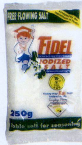
Figure 2. Unregistered FIDEL Free Flowing Salt Iodized Salt