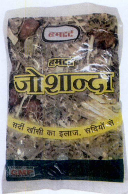
Figure 3. Unregistered HAMDARD Joshanda (In Foreign Language)