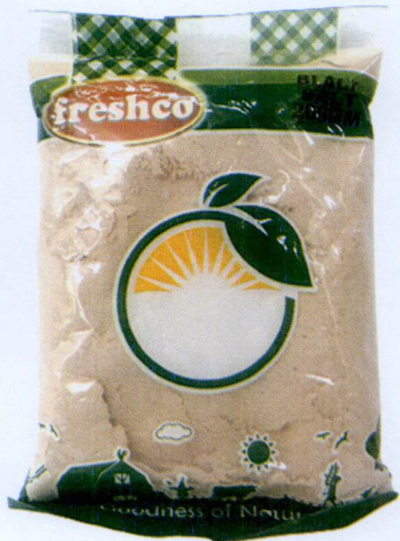
Figure 4. Unregistered FRESHCO Black Salt