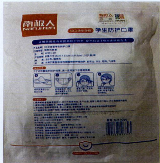
Figure 1. Misbranded Face Mask in Foreign Characters – Nanjiren Face Masks 20 pcs