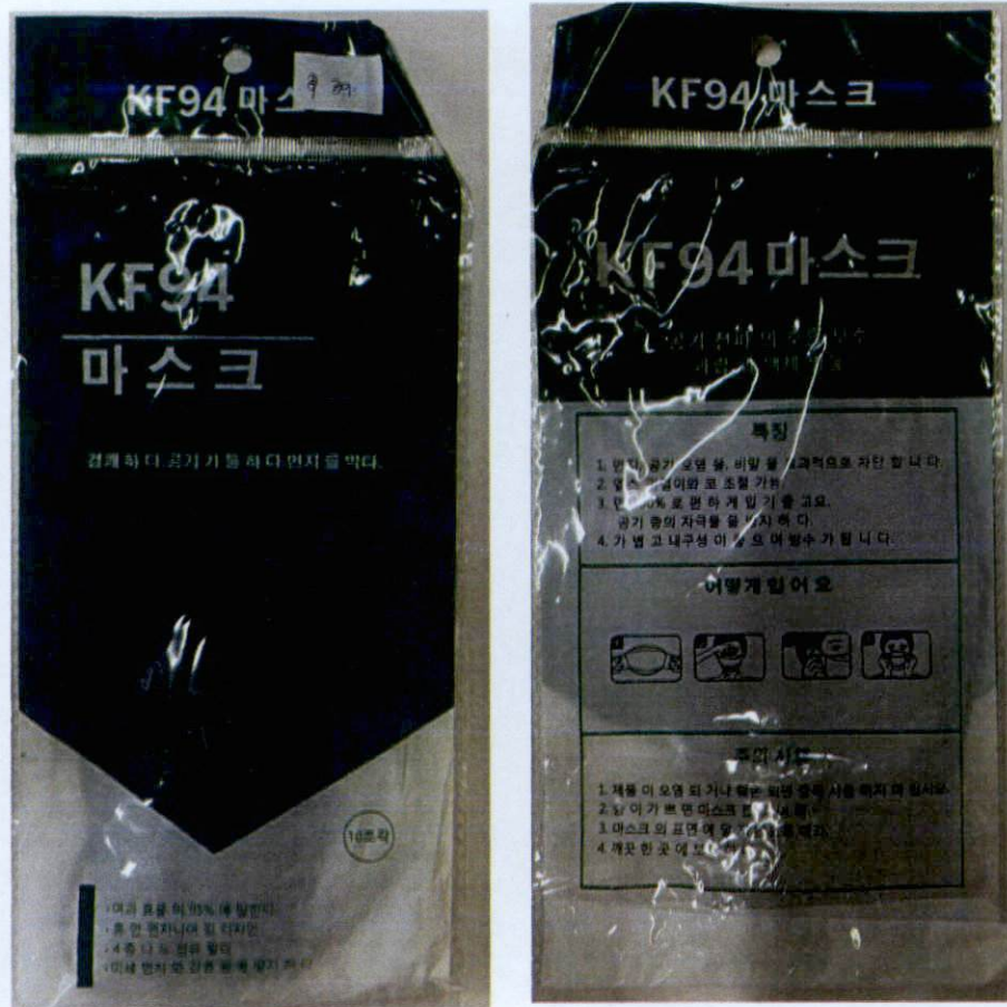
Figure 2. Misbranded Face Mask in Foreign Characters – KF94 Mask Black

The FDA verified through post-marketing surveillance that the abovementioned medical device products are being offered for sale in the local market.