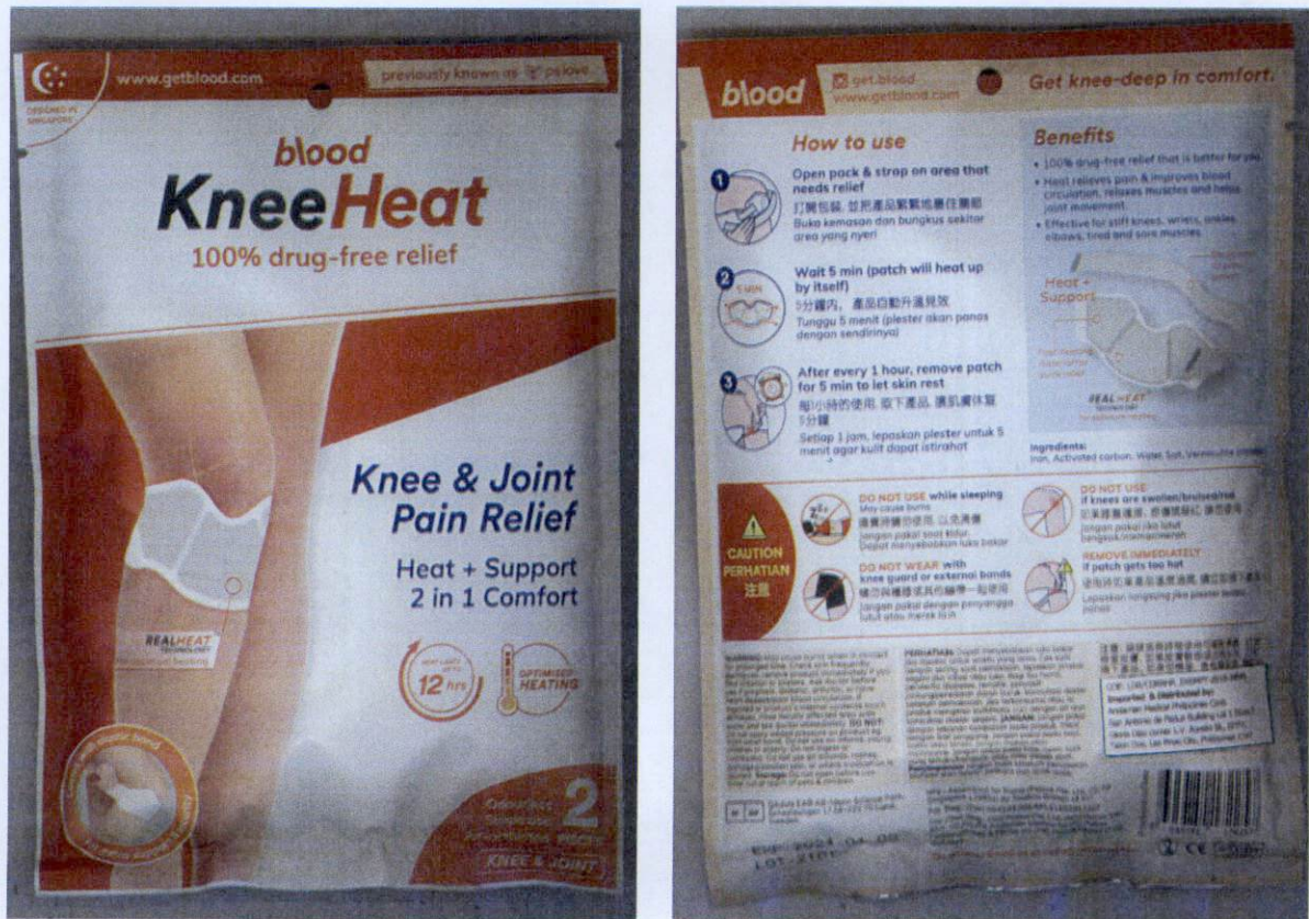
Figure 1. Unnotified Blood KneeHeat Knee & Joint Pain Relief

The Food and Drug Administration (FDA) warns all healthcare professionals and the general public NOT TO PURCHASE AND USE the unnotified medical device product: