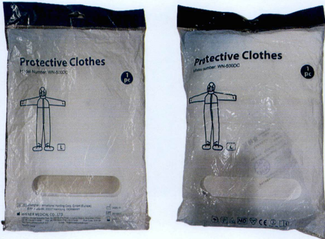
Figure 1. Unnotified Winner Protective Clothes (Model Number: WN-500DC)

The Food and Drug Administration (FDA) warns all healthcare professionals and the general public NOT TO PURCHASE AND USE the unnotified medical device product: