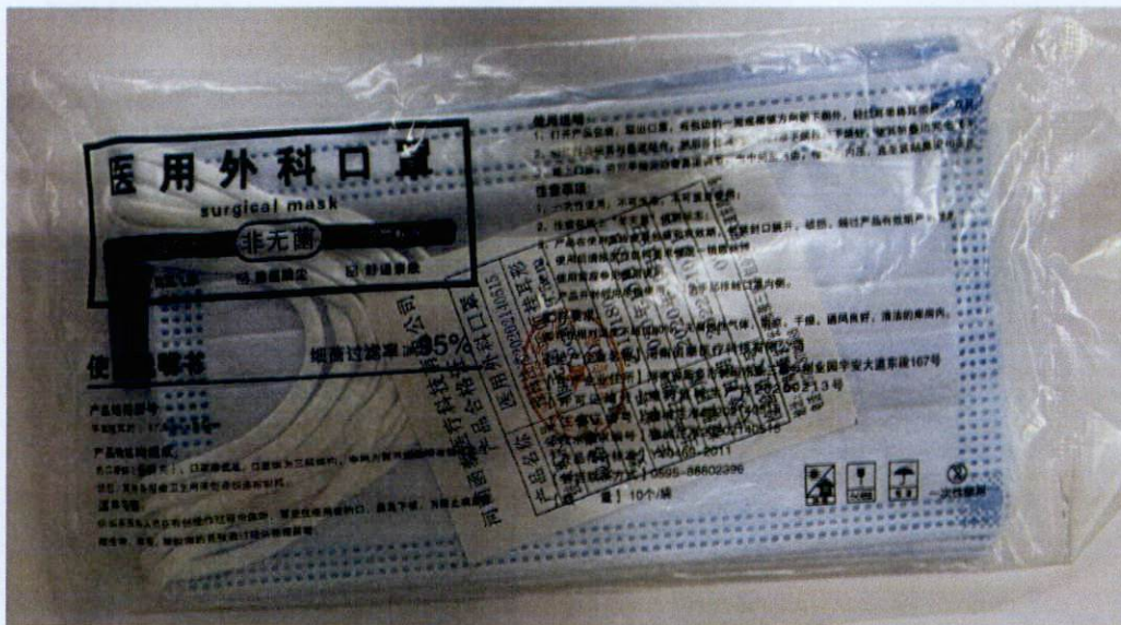
Figure 2. Unnotified Best Jidoc Surgical Mask

The FDA verified through post-marketing surveillance that the above mentioned medical device products are not notified and no corresponding Product Notification Certificates have been issued. Pursuant to the Republic Act No. 9711, otherwise known as the "Food and Drug Administration Act of 2009", the manufacture, importation, exportation, sale, offering for sale, distribution, transfer, non-consumer use, promotion, advertising or sponsorship of health products without the proper authorization is prohibited.