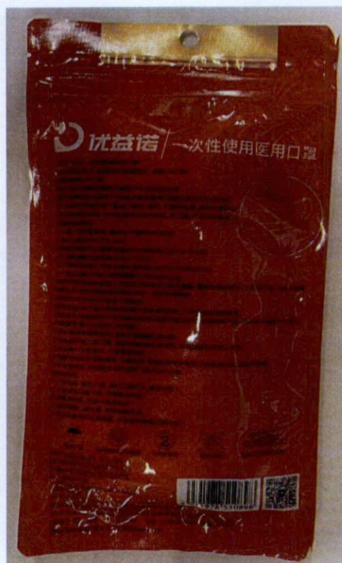
Figure 1. Unnotified Union Disposable Medical Face Mask