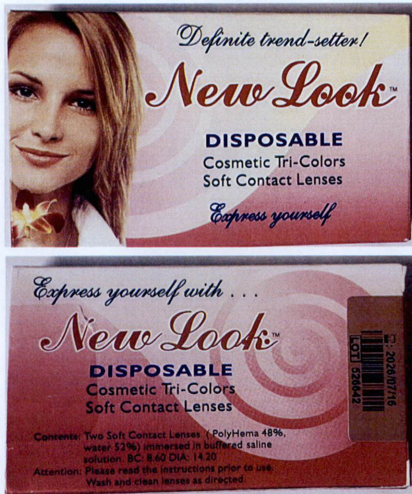
Figure 1. New Look Disposable Cosmetic Tri-Colors Soft Contact Lenses with Expired Certificate of Product Registration

The Food and Drug Administration (FDA) warns all healthcare professionals and the general public NOT TO PURCHASE AND USE the medical device product with expired Certificate of Product Registration: