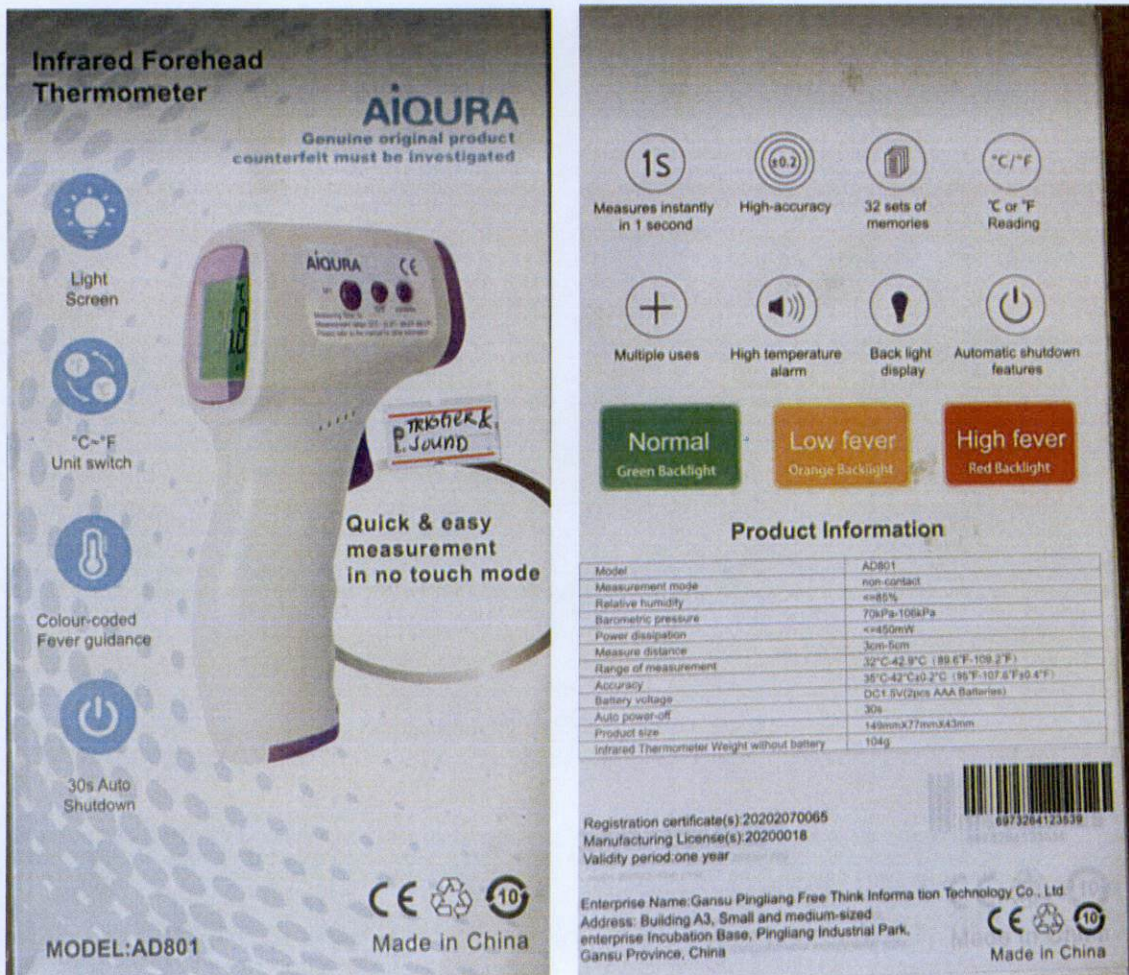
Figure 1. Unregistered AiQURA Infrared Forehead Thermometer

The Food and Drug Administration (FDA) warns all healthcare professionals and the general public NOT TO PURCHASE AND USE the unregistered medical device products: