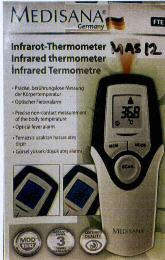
Figure 2. Unregistered Medisana Infrared Thermometer

The FDA verified through post-marketing surveillance that the above mentioned medical device products are not registered and no corresponding Product Registration Certificates have been issued. Pursuant to the Republic Act No. 9711, otherwise known as the “Food and Drug Administration Act of 2009”, the manufacture, importation, exportation, sale, offering for sale, distribution, transfer, non-consumer use, promotion, advertising or sponsorship of health products without the proper authorization is prohibited.