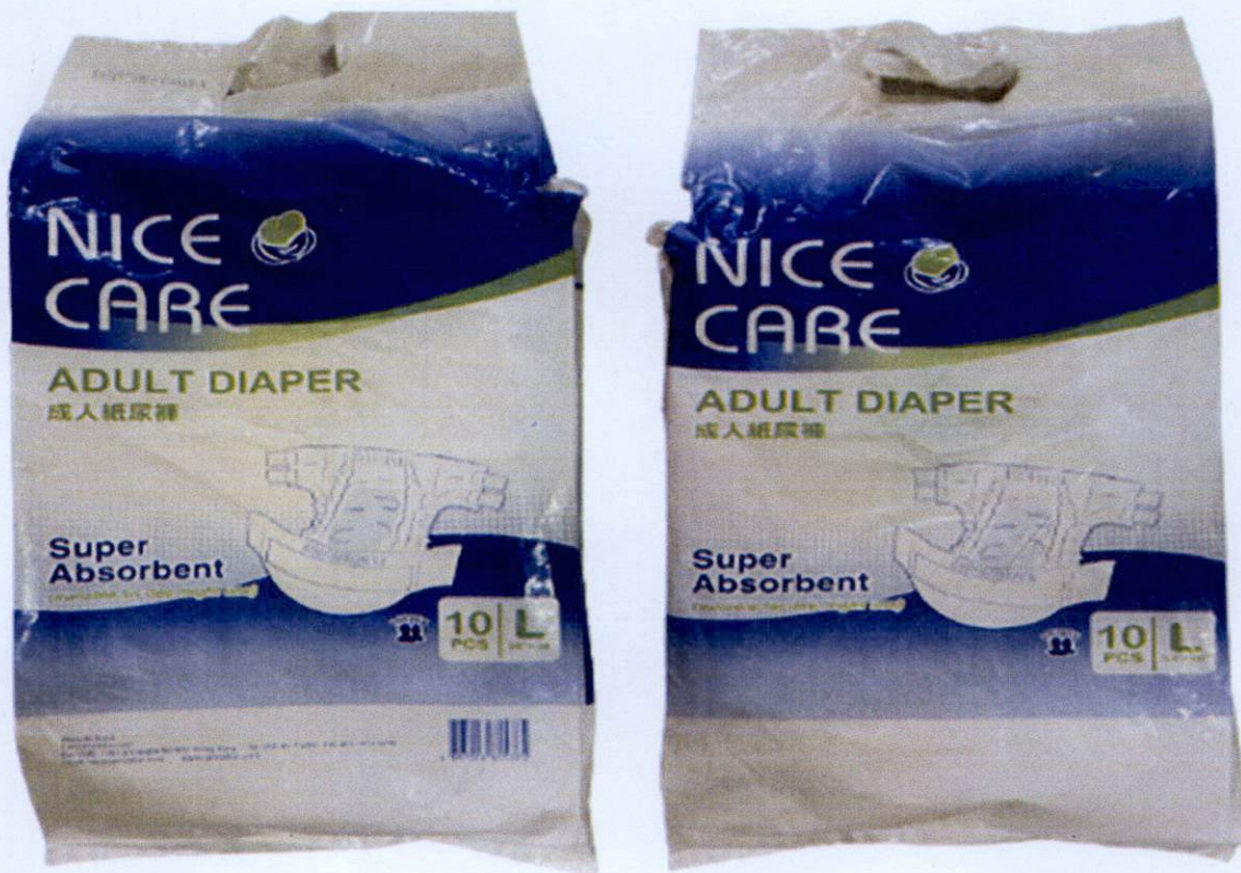
Figure 1. Unnotified Nice Care Adult Diaper (10pcs, L)

The Food and Drug Administration (FDA) warns all healthcare professionals and the general public NOT TO PURCHASE AND USE the unnotified medical device product: