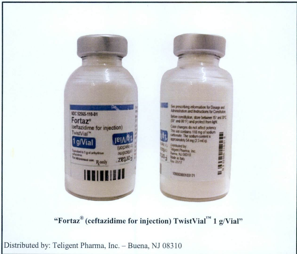
Figure 1: Unregistered drug product

The Food and Drug Administration (FDA) advises the public against the purchase and use of the following unregistered drug products: