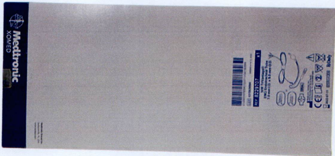
Figure 3. Photo of the Affected EMG Tube 8229707 NIM Trivantage 7.0MM ID

Medtronic has received complaint reports from customers experiencing issues with the use of the abovementioned medical device. Reported issues include users experiencing difficulty passing the electrode check on the NIM Mainframe immediately after intubating the patient, losing the connection between the EMG Tube and the Mainframe during a procedure, resulting in an “Electrode Off”, “Lead Off”, or “Channel Not Reading” error message on the NIM console screen and inability to proceed with nerve monitoring. Lastly, receiving excess signal noise from the NIM console due to lead-off issues.