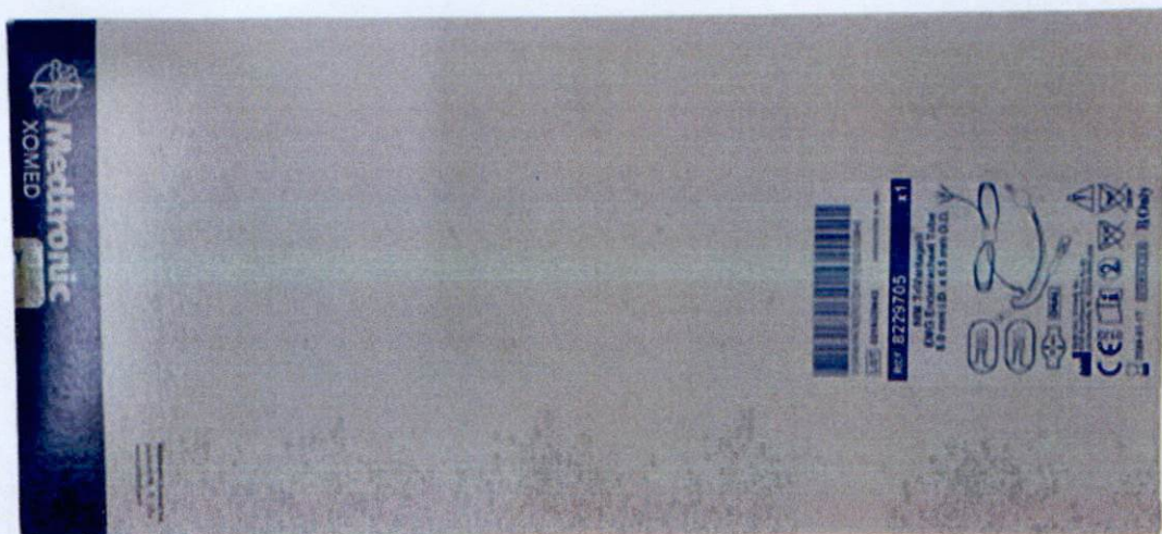
Figure 1. Photo of the Affected EMG Tube 8229705 NIM Trivantage 5.0MM ID