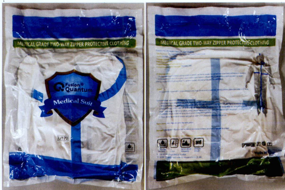
Figure 2. Unnotified Fusion® Quantum Medical Suit L/170 White (Disposable Medical Protective Clothing)

The FDA verified through post-marketing surveillance that the above mentioned medical device products are not notified and no corresponding Product Notification Certificates have been issued. Pursuant to the Republic Act No. 9711, otherwise known as the “Food and Drug Administration Act of 2009”, the manufacture, importation, exportation, sale, offering for sale, distribution, transfer, non-consumer use, promotion, advertising or sponsorship of health products without the proper authorization is prohibited.