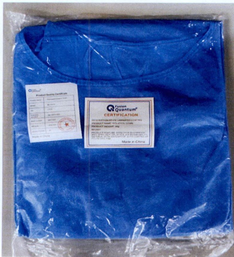
Figure 1. Unnotified Fusion® Quantum Isolation Gown Blue

The Food and Drug Administration (FDA) warns all healthcare professionals and the general public NOT TO PURCHASE AND USE the unnotified medical device products: