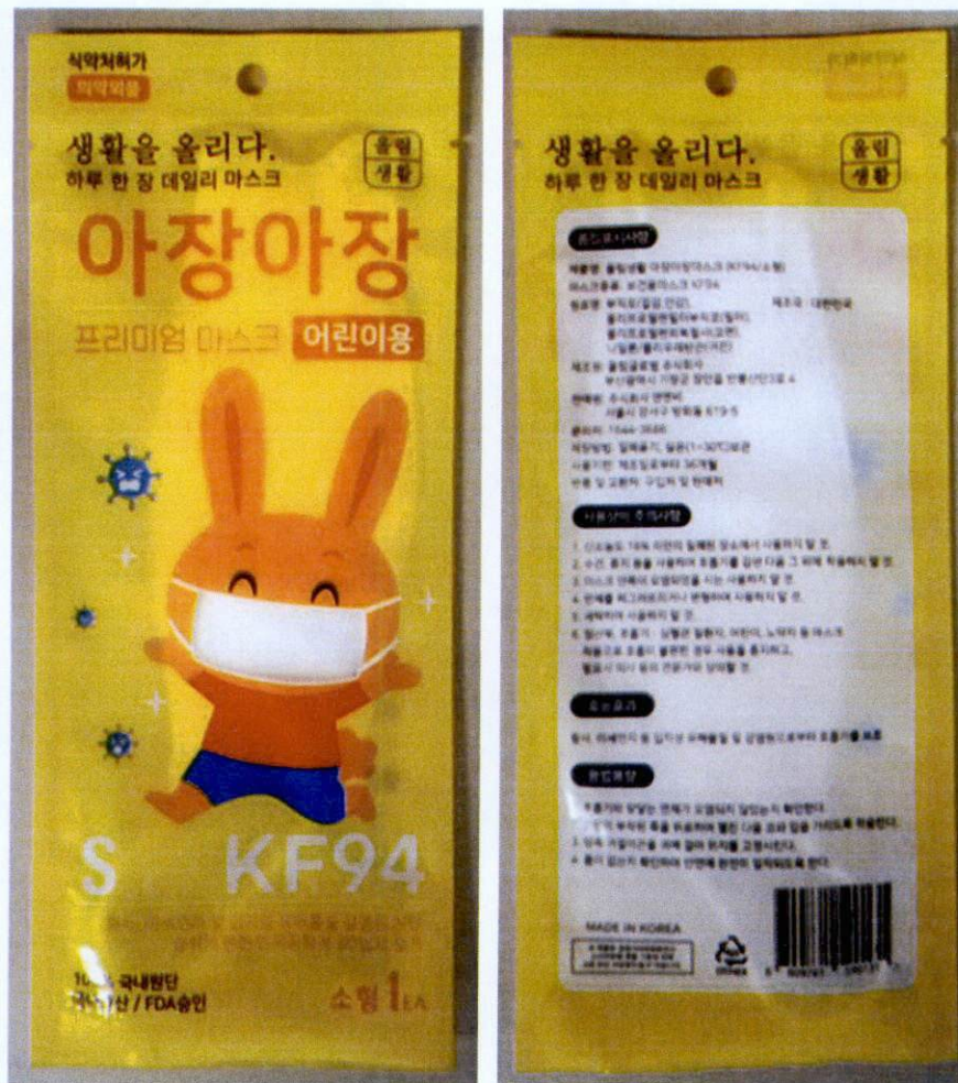
Figure 1. Misbranded KF94 Mask S

The Food and Drug Administration (FDA) warns all healthcare professionals and the general public NOT TO PURCHASE AND USE the misbranded medical device products: