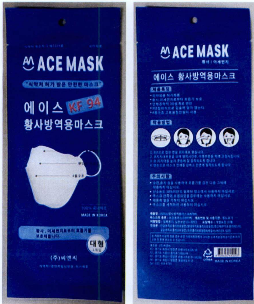
Figure 2. Misbranded Ace Mask KF94

The FDA verified through post-marketing surveillance that the abovementioned medical device products are being offered for sale in the local market.