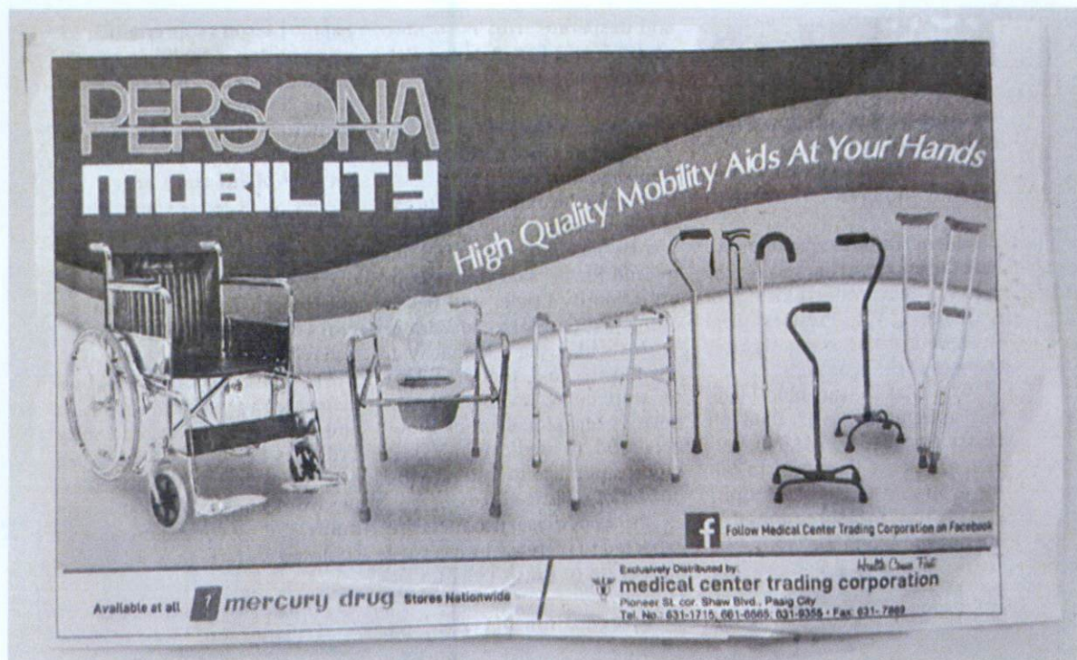
Figure 1. Unnotified Persona® Adult Wheelchair, Unnotified Persona® Commode Chair (With Plastic Arm Pad), Unnotified Persona® Adult Walker, Unnotified Persona® Round Handle Stick Cane, Unnotified Persona® Swan Handle Stick Cane, Unnotified Persona® Quad Cane Small Base

The Food and Drug Administration (FDA) warns all healthcare professionals and the general public NOT TO PURCHASE AND USE the unnotified medical device products: