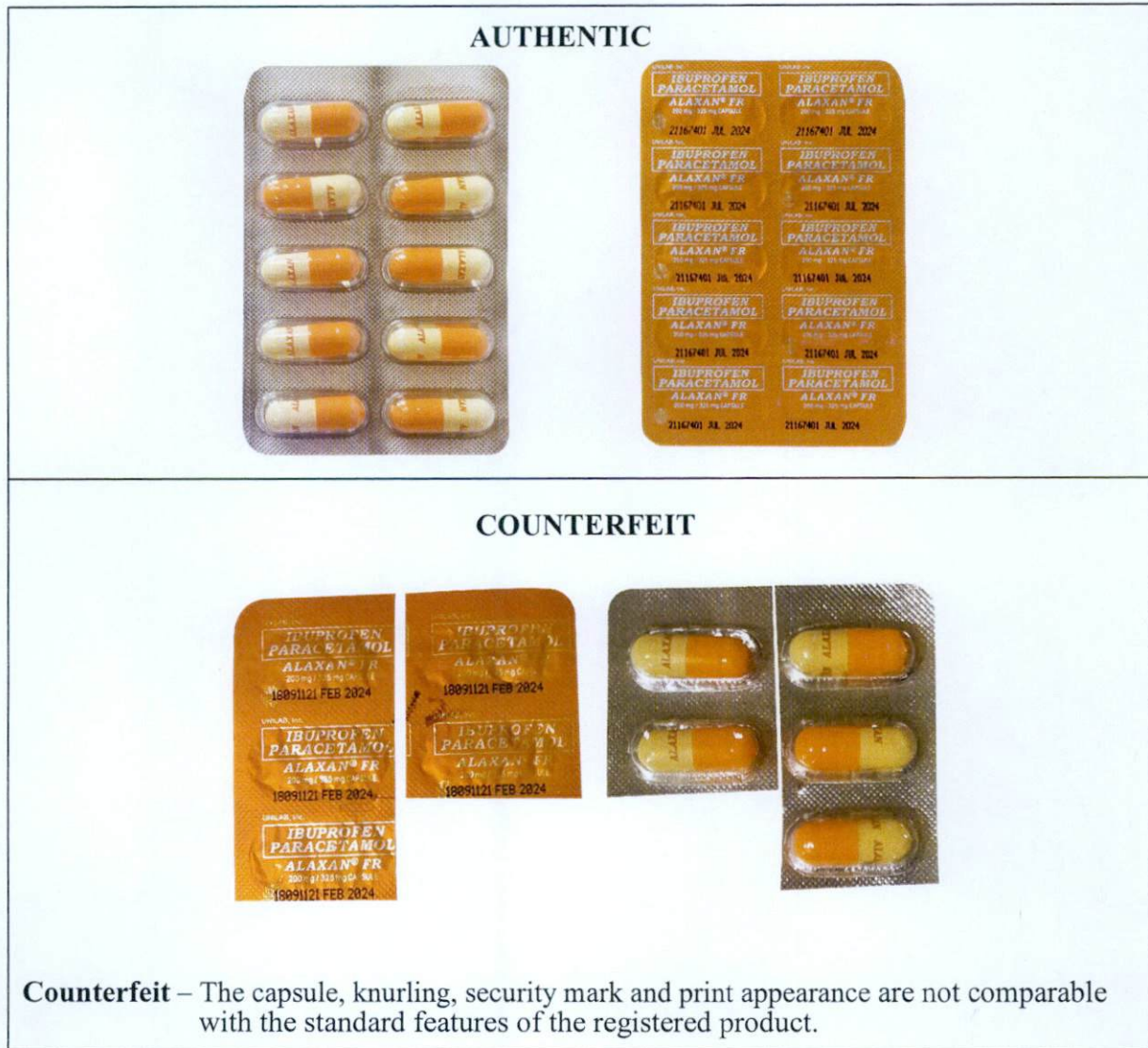
Figure 1. Comparison between the Authentic and Verified Counterfeit Ibuprofen/ Paracetamol (Alaxan® FR) 200 mg / 325 mg Capsule (Lot No. 18091121)

The Food and Drug Administration (FDA) advises the public against the purchase and use of the counterfeit version of the following product: