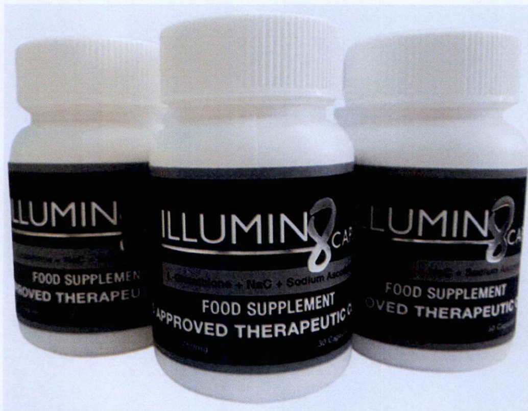
Figure 1. Unregistered ILLUMIN8 Caps L-Glutathione + NaC + Sodium Ascorbate Food Supplement

The Food and Drug Administration (FDA) warns all healthcare professionals and the general public NOT TO PURCHASE AND CONSUME the following unregistered food supplements: