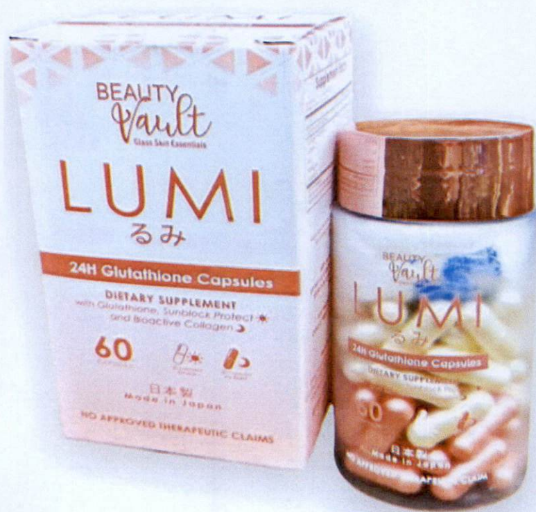
Figure 3.. Unregistered BEAUTY VAULT Lumi 24H Glutathione Capsules Dietary Supplement