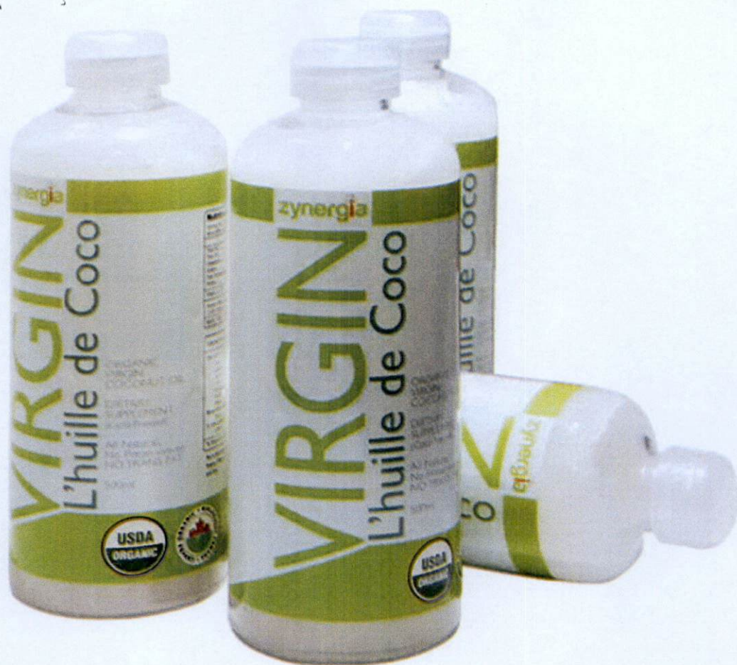
Figure 2. Unregistered ZYNERGIA Virgin Coconut Oil (L'huile de Coco)