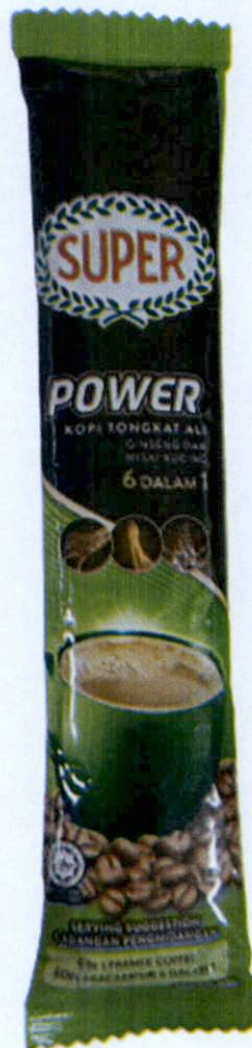
Figure 1. Unregistered SUPER POWER Kopi Tongkat Ali 6 in 1 Premix Coffee, Net Wt. 30g

The Food and Drug Administration (FDA) warns all healthcare professionals and the general public NOT TO PURCHASE AND CONSUME the following unregistered food products: