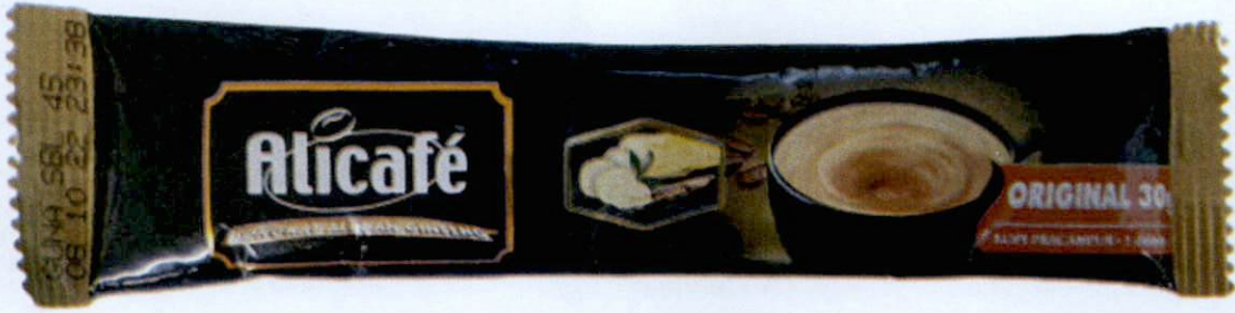
Figure 2. Unregistered ALICAFE Tongkat Ali Dan Ginseng Original, Net Wt. 30g