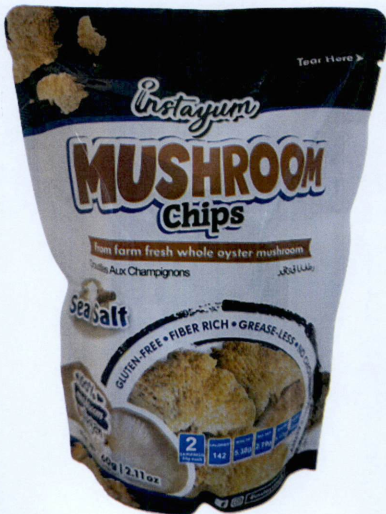
Figure 3. Unregistered INSTAYUM Mushroom Chips Sea Salt, Net Wt. 60g