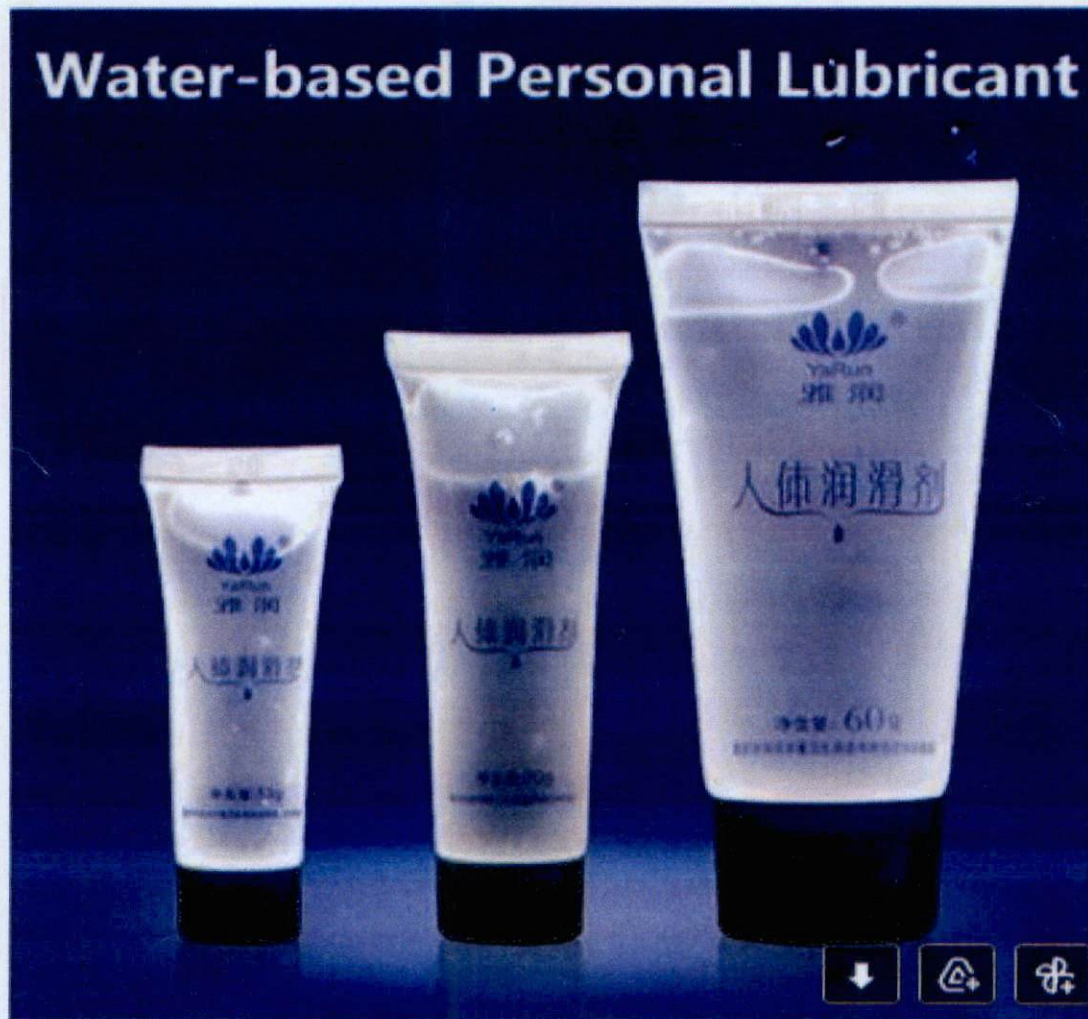
Figure 1. Unnotified Specified Brand of Water-based Personal Lubricant

The Food and Drug Administration (FDA) warns all healthcare professionals and the general public NOT TO PURCHASE AND USE the unnotified medical device product: