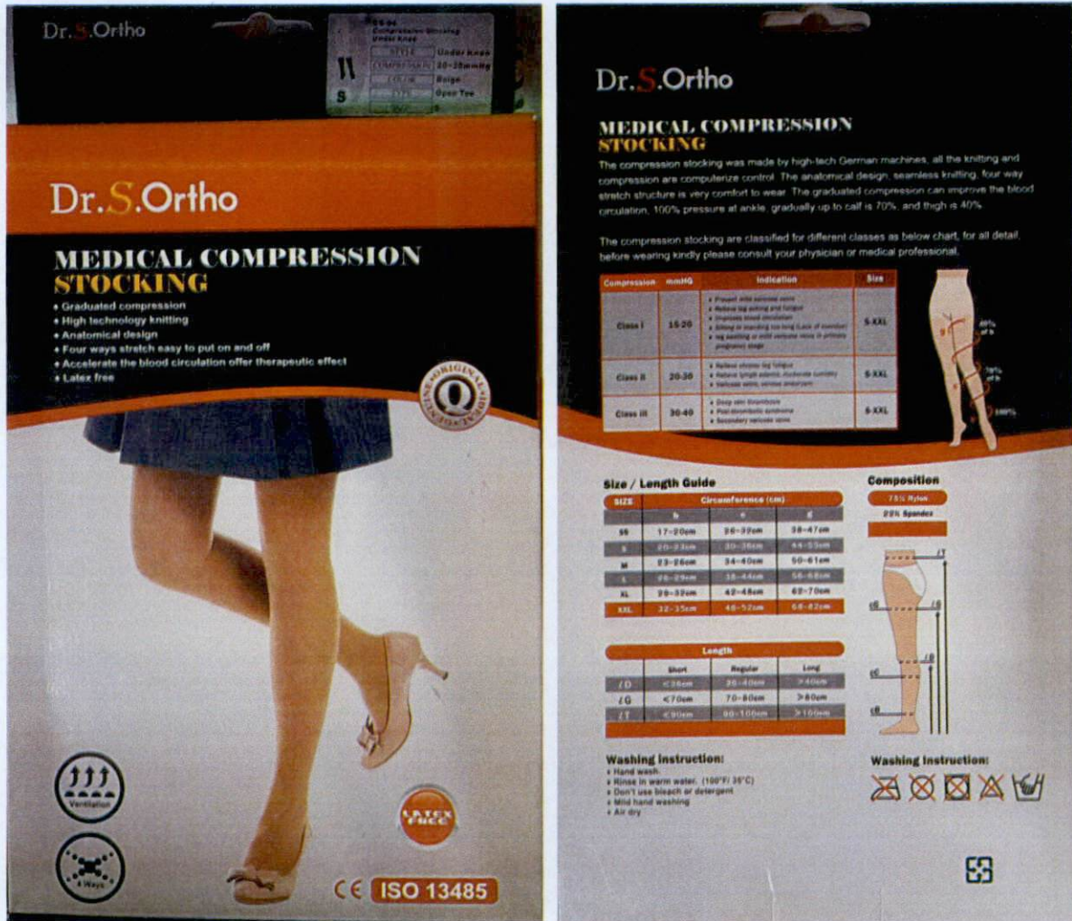
Figure 2. Unnotified Dr. S. Ortho Medical Compression Stocking

The FDA verified through post-marketing surveillance that the above mentioned medical device products are not notified and no corresponding Product Notification Certificates have been issued. Pursuant to the Republic Act No. 9711, otherwise known as the “Food and Drug Administration Act of 2009”, the manufacture, importation, exportation, sale, offering for sale, distribution, transfer, non-consumer use, promotion, advertising or sponsorship of health products without the proper authorization is prohibited.