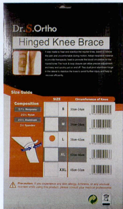
Figure 1. Unnotified Dr. S. Ortho Hinged Knee Brace