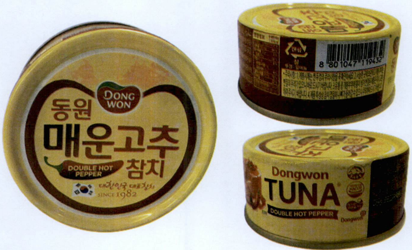
Figure 5. Unregistered DONGWON Tuna Double Hot Pepper (In Foreign Language)