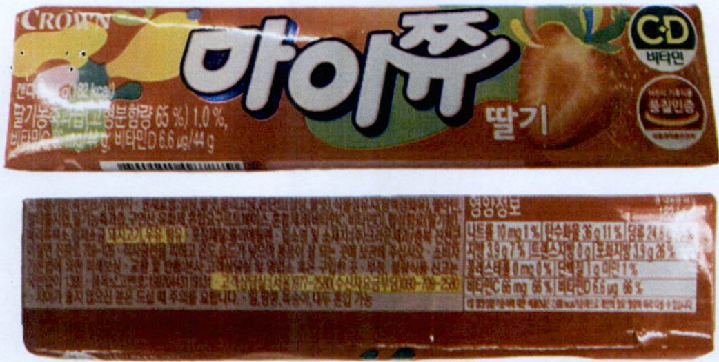
Figure 4. Unregistered CROWN Food Product with Strawberry Image in Red Packaging (In Foreign Language)