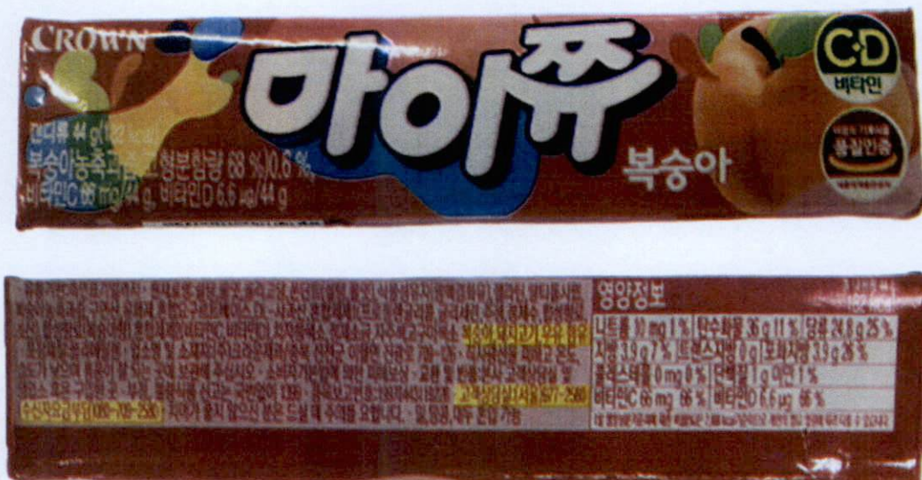
Figure 3. Unregistered CROWN Food Product with Peach Image in Pink Packaging (In Foreign Language)