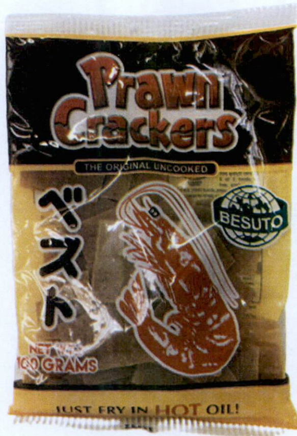
Figure 2. Unregistered BESUTO Prawn Crackers The Original Uncooked