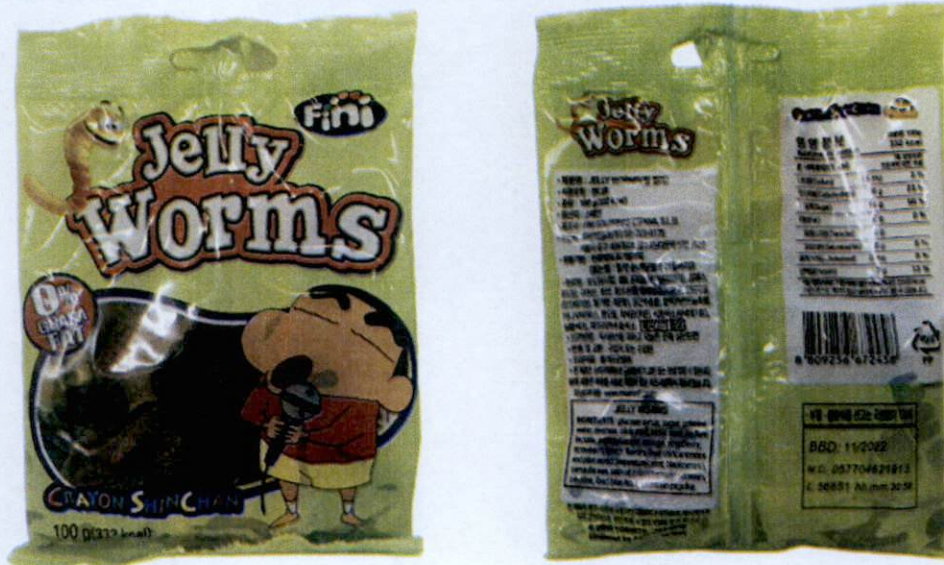
Figure 1. Unregistered FINI Jelly Worms Crayon Shinchan (In Foreign Language)

The Food and Drug Administration (FDA) warns all healthcare professionals and the general public NOT TO PURCHASE AND CONSUME the following unregistered food products: