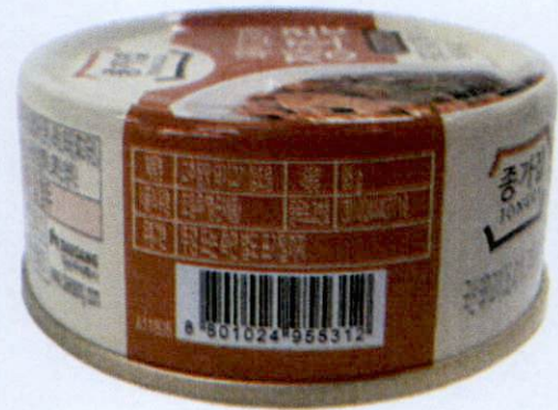
Figure 2. Unregistered JONGGA Canned Food Product with Pepper Image in White and Red Aluminum Can (In Foreign Language)