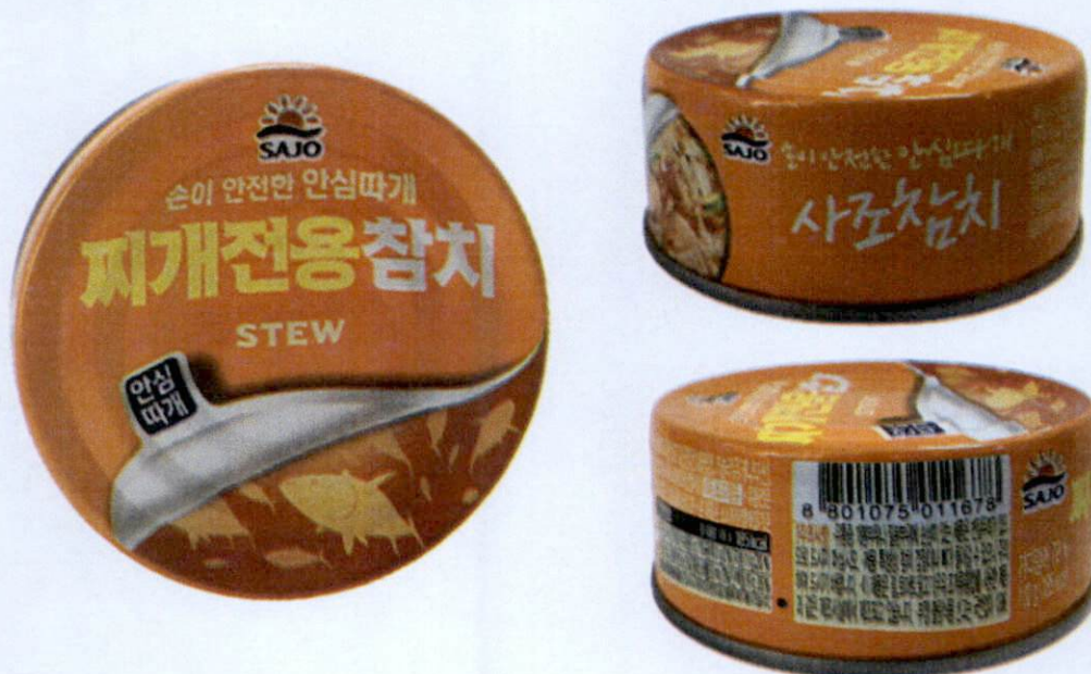
Figure 1. Unregistered SAJO Stew Canned Food Product in Orange Aluminum Can (In Foreign Language)

The Food and Drug Administration (FDA) warns all healthcare professionals and the general public NOT TO PURCHASE AND CONSUME the following unregistered food products: