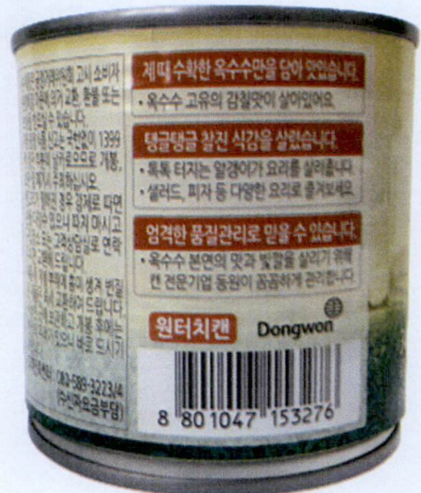
Figure 3. Unregistered DONGWON Corn Kernels with Yellow and Green Label in Aluminum Can (In Foreign Language)