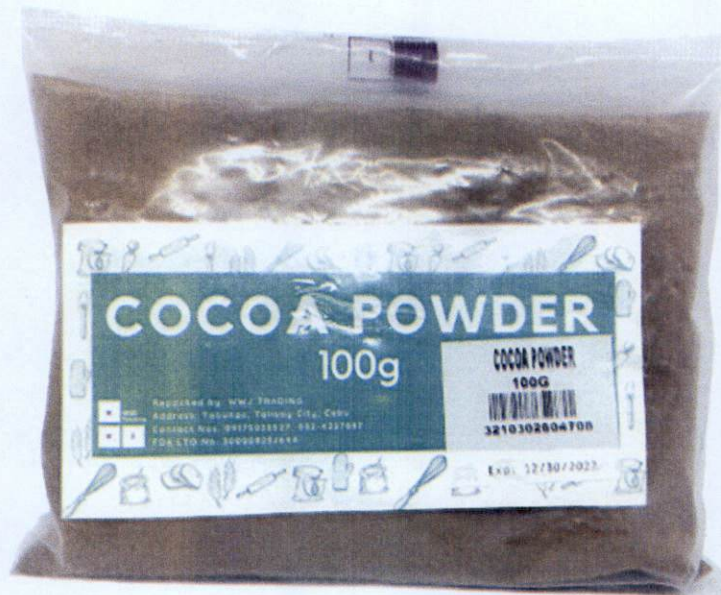
Figure 1. Unregistered (UNBRANDED) Cocoa Powder

The Food and Drug Administration (FDA) warns all healthcare professionals and the general public NOT TO PURCHASE AND CONSUME the following unregistered food products: