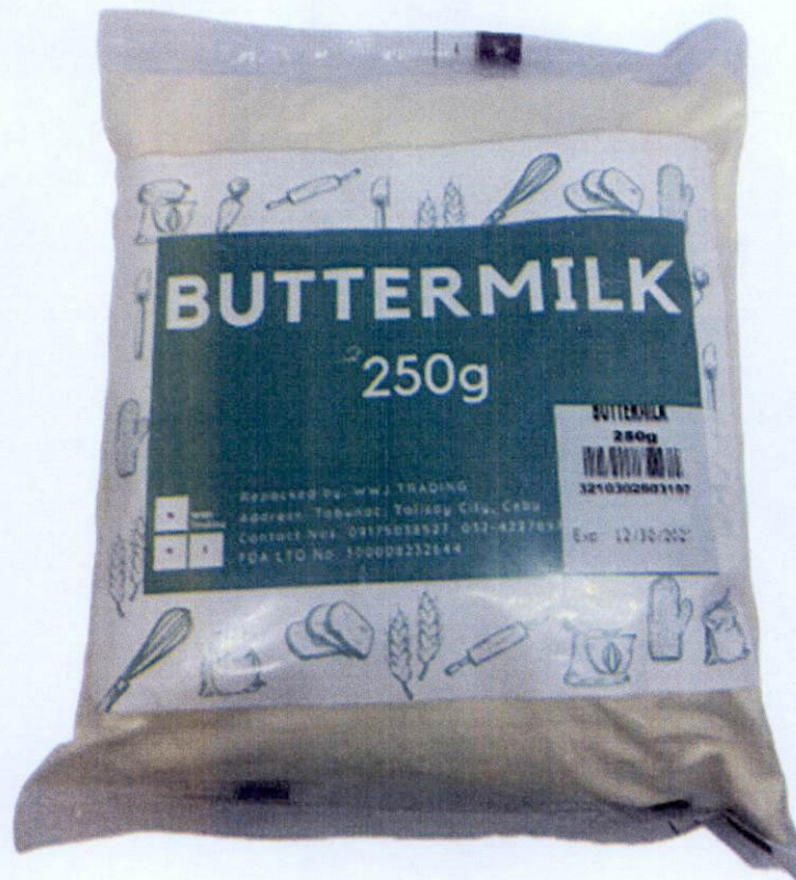
Figure 4. Unregistered (UNBRANDED) Buttermilk