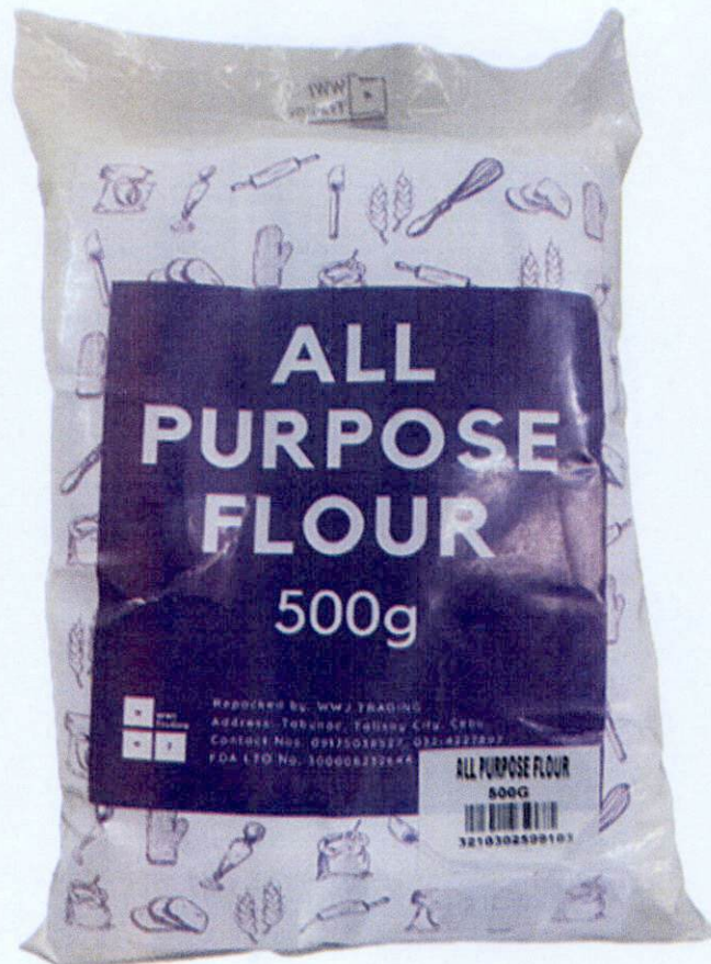
Figure 5. Unregistered (UNBRANDED) All Purpose Flour