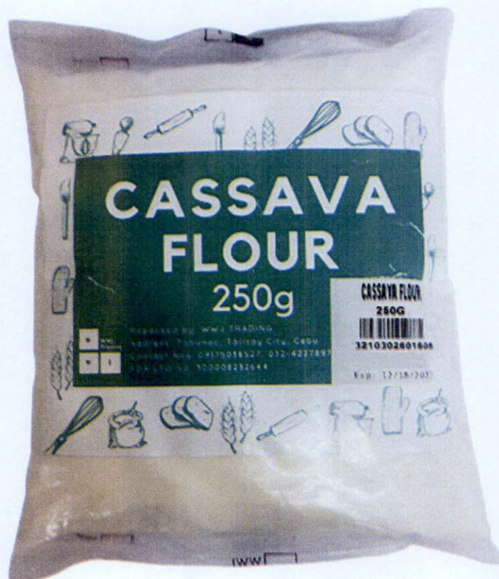
Figure 3. Unregistered (UNBRANDED) Cassava Flour