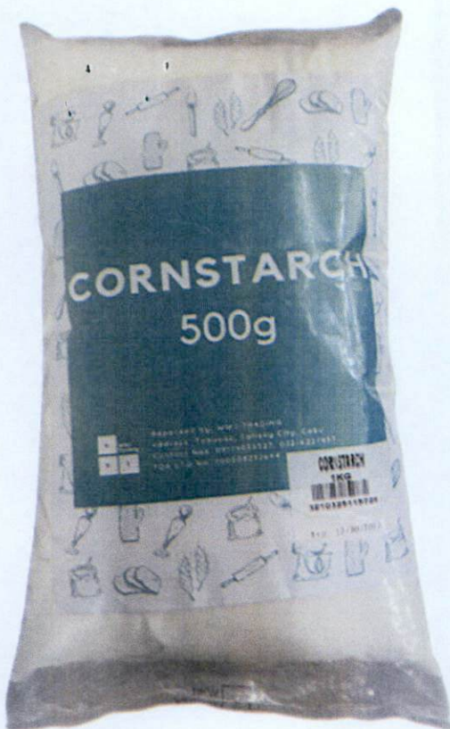
Figure 2. Unregistered (UNBRANDED) Cornstarch