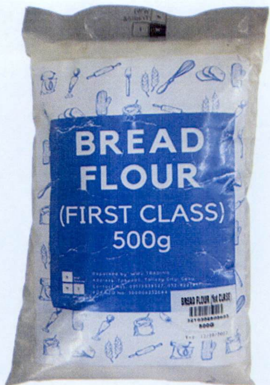
Figure 3. Unregistered (UNBRANDED) Bread Flour (First Class)