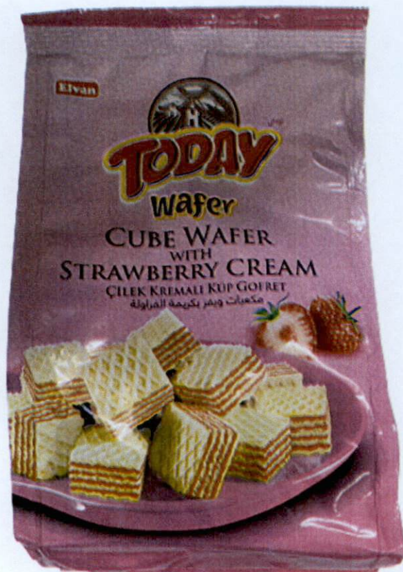
Figure 5. Unregistered ELVAN TODAY WAFER Cube Wafer with Strawberry Cream