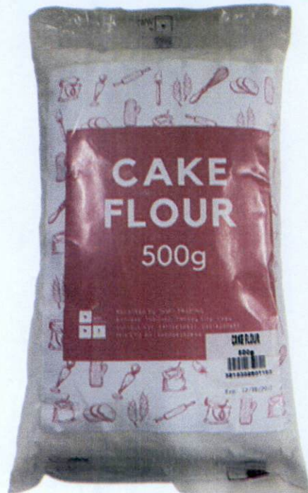
Figure 1. Unregistered (UNBRANDED) Cake Flour

The Food and Drug Administration (FDA) warns all healthcare professionals and the general public NOT TO PURCHASE AND CONSUME the following unregistered food products: