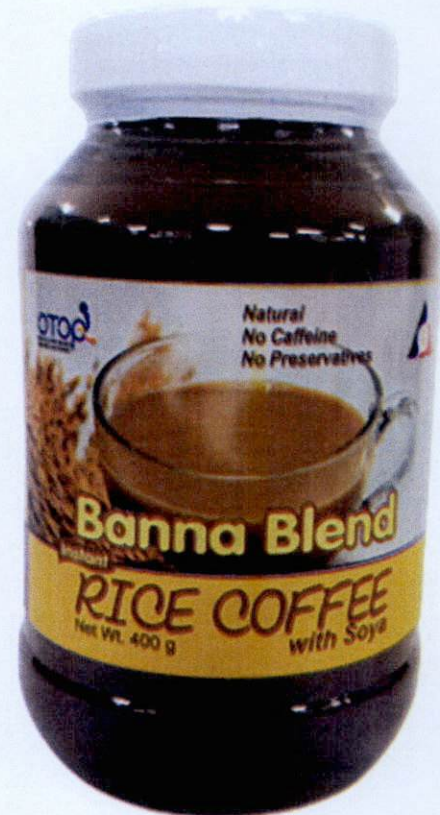
Figure 5. Unregistered OTOPIPHILIPPINES Banana Blend Instant Rice Coffee with Soya