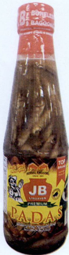
Figure 4. Unregistered JB LINGAYEN PREMIUM Padas (Salted Tiny Ziganid Fish)