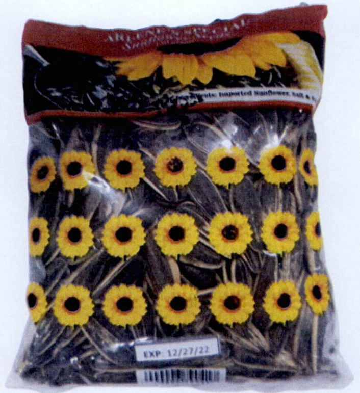
Figure 3. Unregistered ARLENE'S SPECIAL Sunflower Seeds