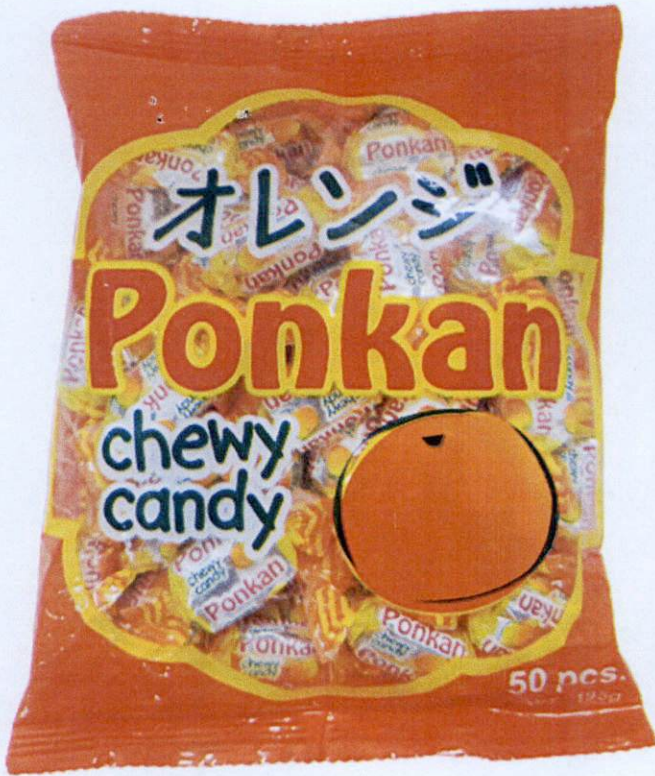
Figure 2. Unregistered PONKAN Chewy Candy