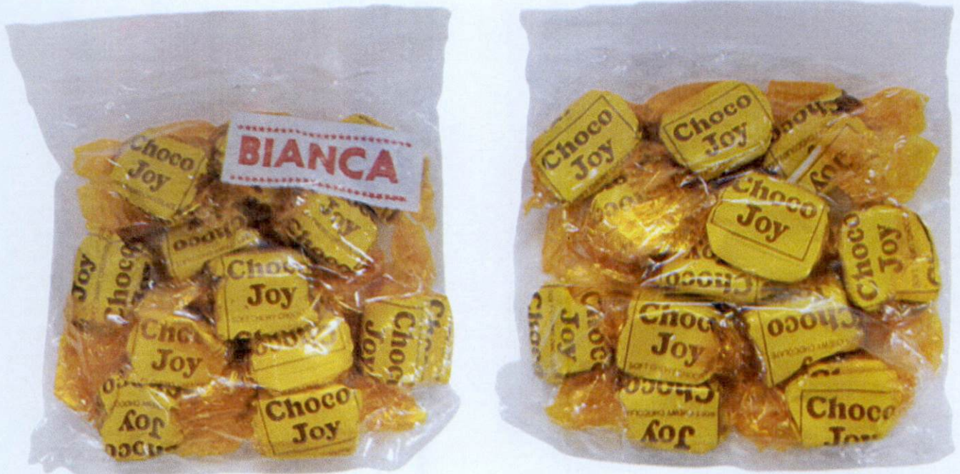
Figure 1. Unregistered BIANCA Choco Joy Soft Chewy Chocolate

The Food and Drug Administration (FDA) warns all healthcare professionals and the general public NOT TO PURCHASE AND CONSUME the following unregistered food products: