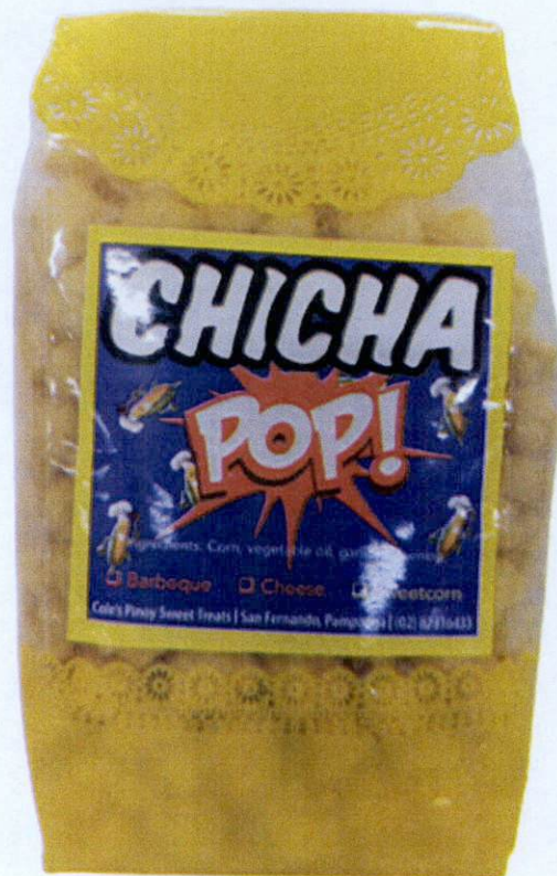
Figure 3. Unregistered COLE'S PINOY SWEET TREATS Chicha Pop