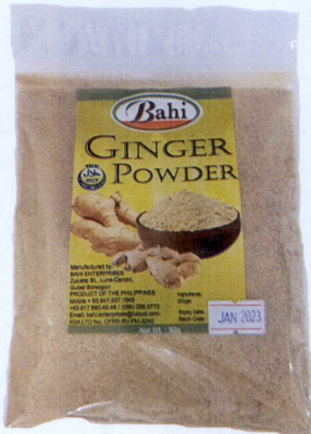
Figure 1. Unregistered BAH I Ginger Powder

The Food and Drug Administration (FDA) warns all healthcare professionals and the general public NOT TO PURCHASE AND CONSUME the following unregistered food products: