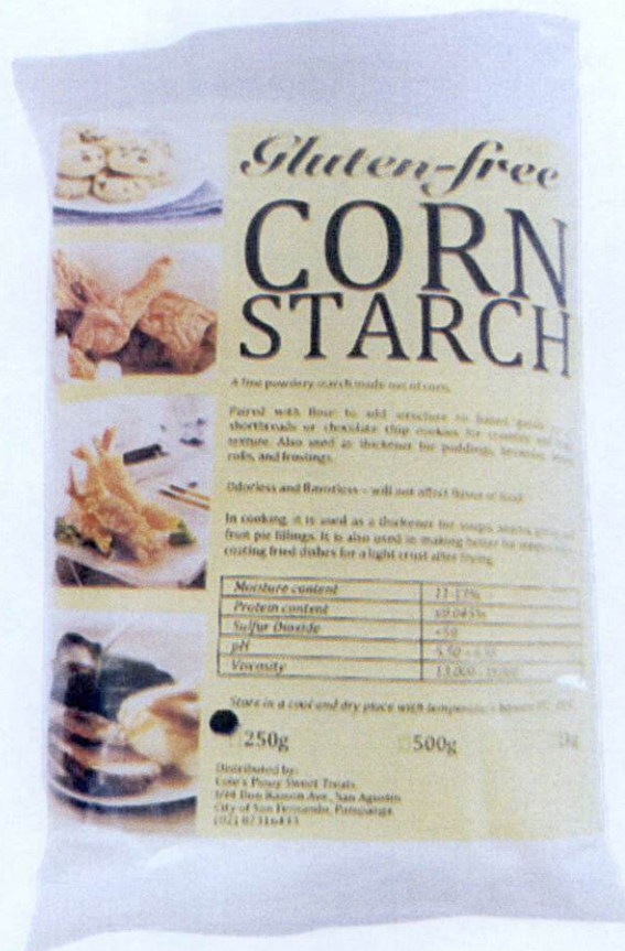
Figure 2. Unregistered COLE'S PINOY SWEET TREATS Gluten-Free Cornstarch