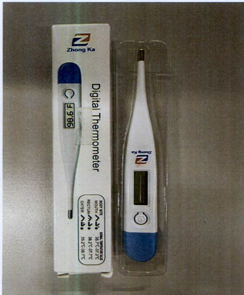
Figure 1. Unregistered Zhong Ka Digital Thermometer

The Food and Drug Administration (FDA) warns all healthcare professionals and the general public NOT TO PURCHASE AND USE the unregistered medical device product: