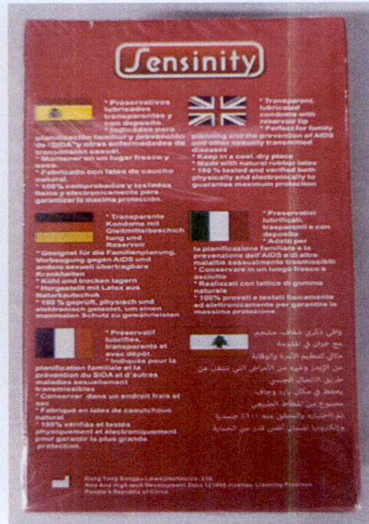
Figure 3. Unregistered Sensinity Rose 12/u Condoms