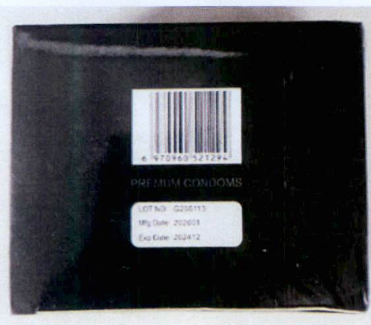
Figure 1. Unregistered OLO Feeling Ultrathin 001 Natural Rubber Latex Condoms