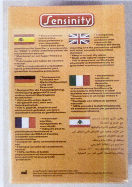
Figure 2. Unregistered Sensinity Vanilla 12/u Condoms