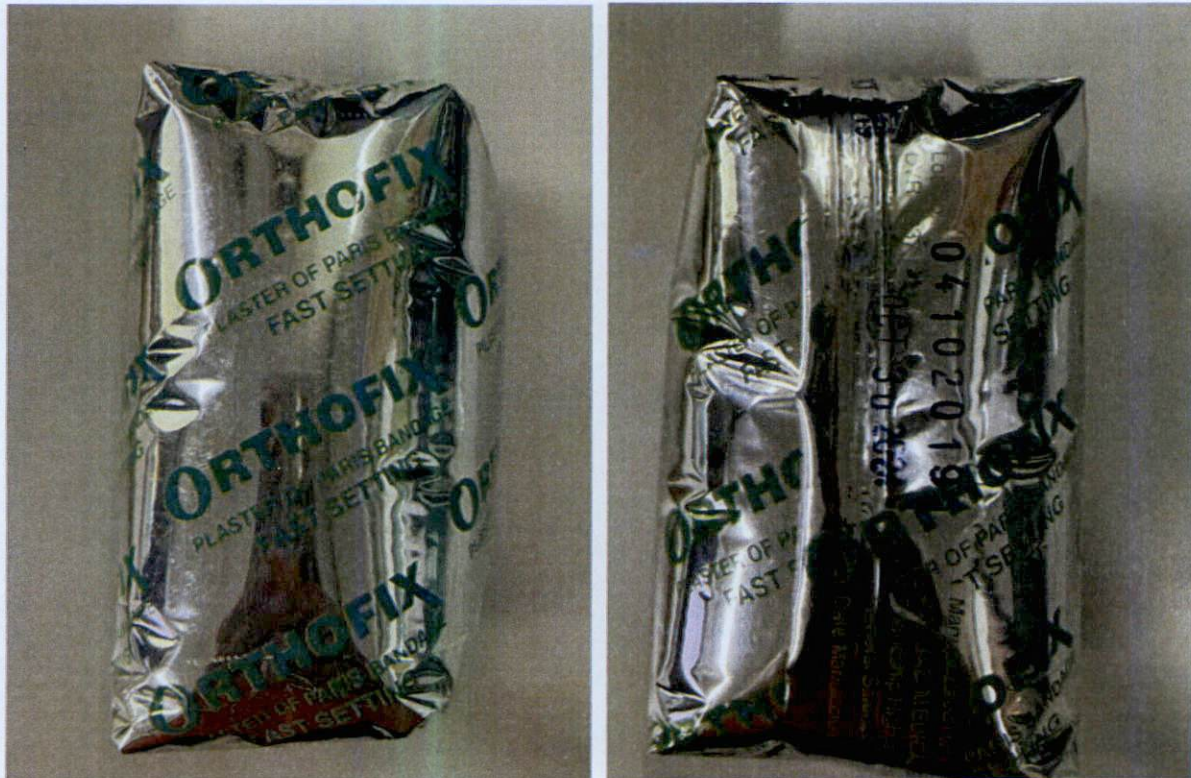
Figure 1. Unnotified Orthofix Plaster of Paris Bandage

The Food and Drug Administration (FDA) warns all healthcare professionals and the general public NOT TO PURCHASE AND USE the unnotified medical device product: