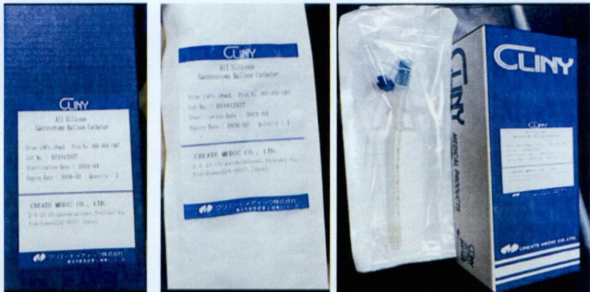
Figure 1. Unregistered All Silicone Gastrostomy Balloon Catheter

The Food and Drug Administration (FDA) warns all healthcare professionals and the general public NOT TO PURCHASE AND USE the unregistered medical device product: