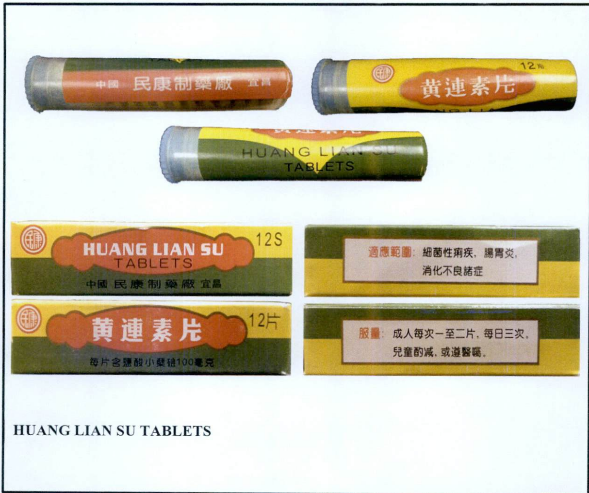
Figure 1: Unregistered drug product

The Food and Drug Administration (FDA) advises the public against the purchase and use of the unregistered drug product: