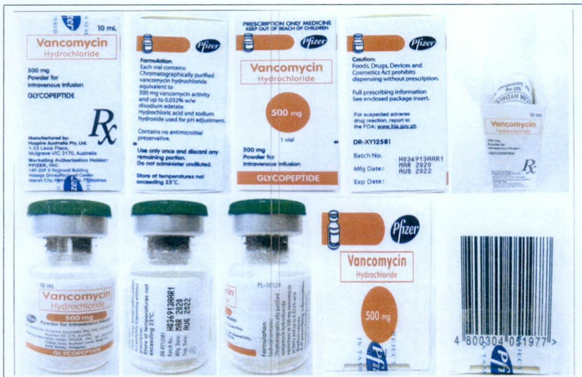
Figure 2. Vancomycin Hydrochloride 500 mg Powder for IV Infusion (Batch No. H036913AAR1) for voluntary recall

The voluntary recall is pursued by the MAH due to out-of-specification stability results which do not meet the shelf-life specification for potency and have atypically declining potency over the 30-month product shelf-life. While no adverse events or product complaints have been received regarding these batches to date, the analysis predicts that the product may be at 78% - 87% potency by end of shelf-life. Further investigation is ongoing to determine the root cause and identify preventive actions to avoid future impact on other Vancomycin Hydrochloride 500 mg batches.