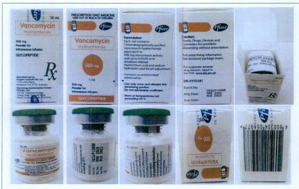
Figure 1. Vancomycin Hydrochloride 500 mg Powder for IV Infusion (Batch No. H036913AAR) for voluntary recall