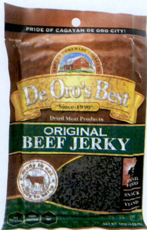
Figure 4. Unregistered DE ORO'S BEST DRIED MEAT PRODUCTS Original Beef Jerky