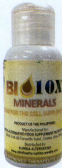
Figure 1. Unregistered BIO10X MINERALS Food for the Cell Supplement

The Food and Drug Administration (FDA) warns all healthcare professionals and the general public NOT TO PURCHASE AND CONSUME the following unregistered food supplement and food products: