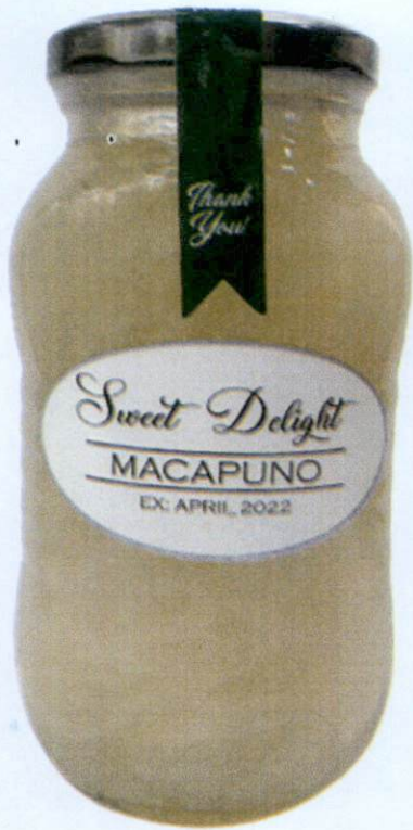
Figure 2. Unregistered SWEET DELIGHT Macapuno