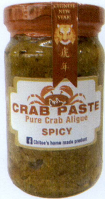
Figure 3. Unregistered CHITOE'S HOME MADE PRODUCT Crab Paste Pure Crab Aligue Spicy