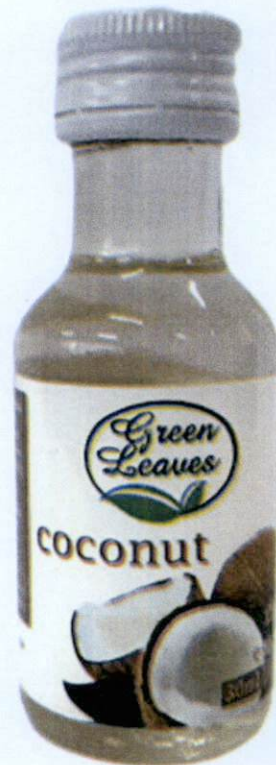
Figure 5. Unregistered GREEN LEAVES Coconut Flavor Essence