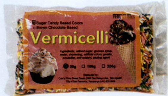
Figure 3. Unregistered COLE'S PINOY SWEET TREATS Vermicelli Sugar Candy Based Colors