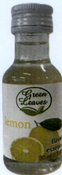
Figure 1. Unregistered GREEN LEAVES Lemon Flavor Essence

The Food and Drug Administration (FDA) warns all healthcare professionals and the general public NOT TO PURCHASE AND CONSUME the following unregistered food products: