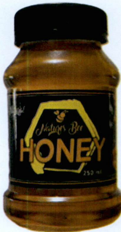
Figure 4. Unregistered NATURES BEE Honey