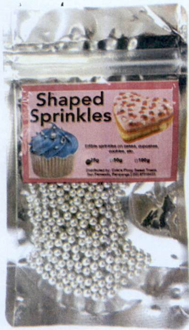
Figure 2. Unregistered COLE'S PINOY SWEET TREATS Shaped Sprinkles