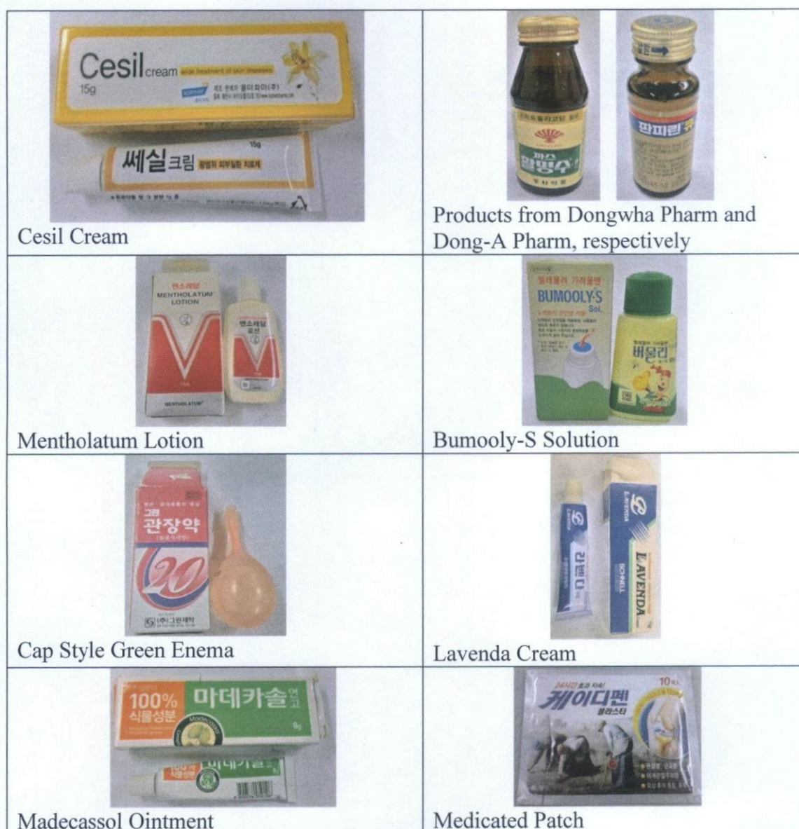
Table 1. Unregistered Drug Products obtained from various stores along Friendship Highway in Angeles City.

The Food and Drug Administration advises the public against the use of the following unregistered products: