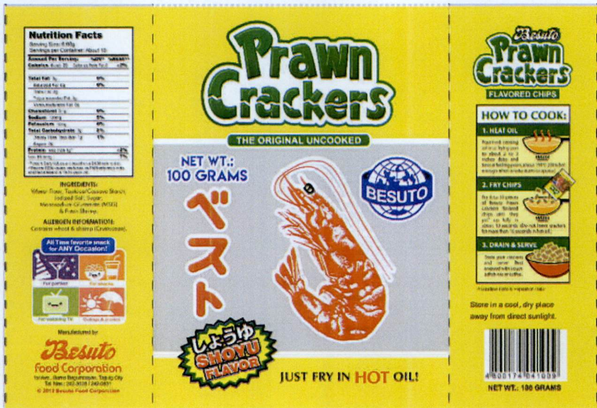
Figure 1. The Approved label of BESUTO The Original Uncooked Prawn Crackers Shoyu Flavor with registration number FR- 4000009502020 issued on 02 June 2022 valid until 02 June 2024 .

The Food and Drug Administration (FDA) informs the public that the following food product BESUTO The Original Uncooked Prawn Crackers Shoyu Flavor is now registered by the Market Authorization Holder (MAH) BESUTO FOOD CORPORATION in accordance to existing FDA rules and regulations.