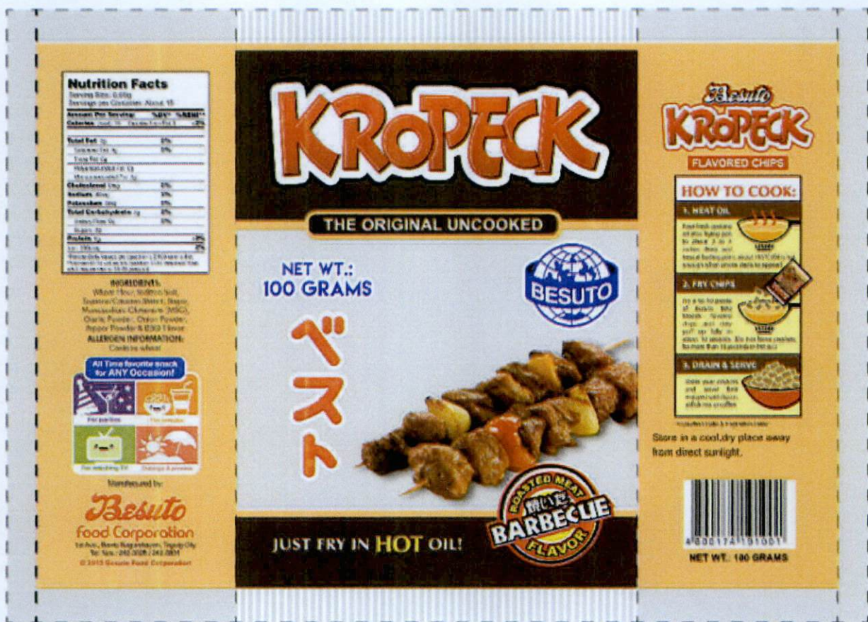
Figure 1. The Approved label of BESUTO The Original Uncooked Kropeck - Roasted Meat Barbecue Flavor with registration number FR- 4000009501548 issued on 02 June 2022 valid until 02 June 2024 .

The Food and Drug Administration (FDA) informs the public that the food product BESUTO The Original Uncooked Kropeck - Roasted Meat Barbecue Flavor is now registered by the Market Authorization Holder (MAH) BESUTO FOOD CORPORATION in accordance to existing FDA rules and regulations.