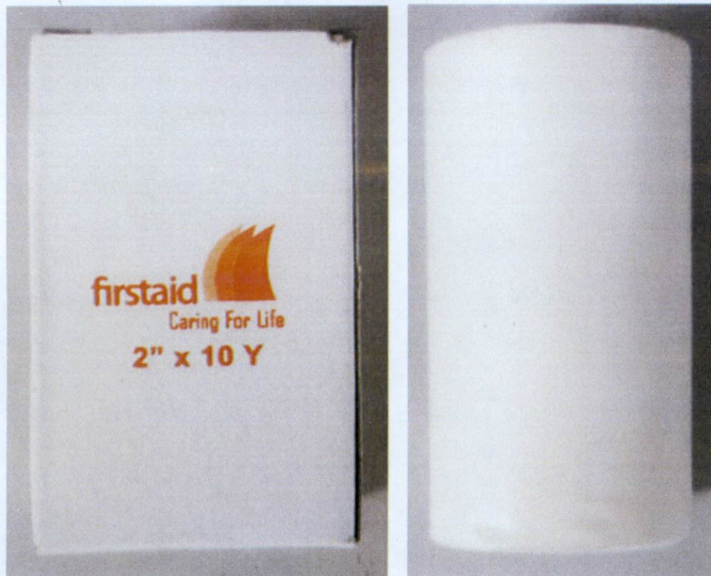
Figure 1. Unnotified Firstaid Caring For Life 2" x 10 Y

The Food and Drug Administration (FDA) warns all healthcare professionals and the general public NOT TO PURCHASE AND USE the unnotified medical device products: