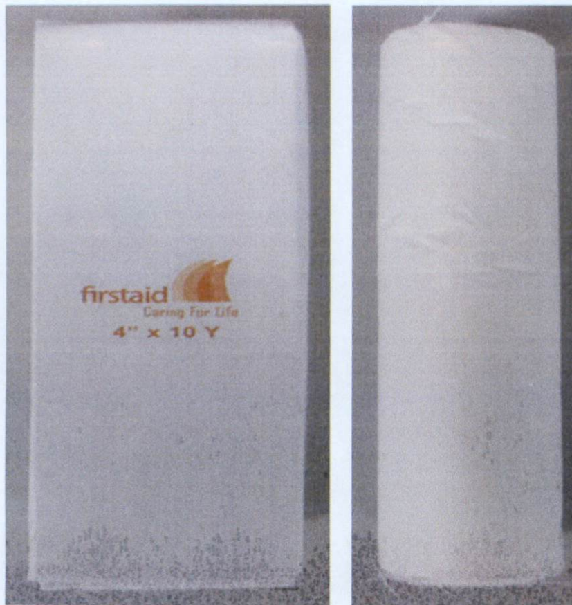
Figure 3. Unnotified Firstaid Caring For Life 4" x 10 Y