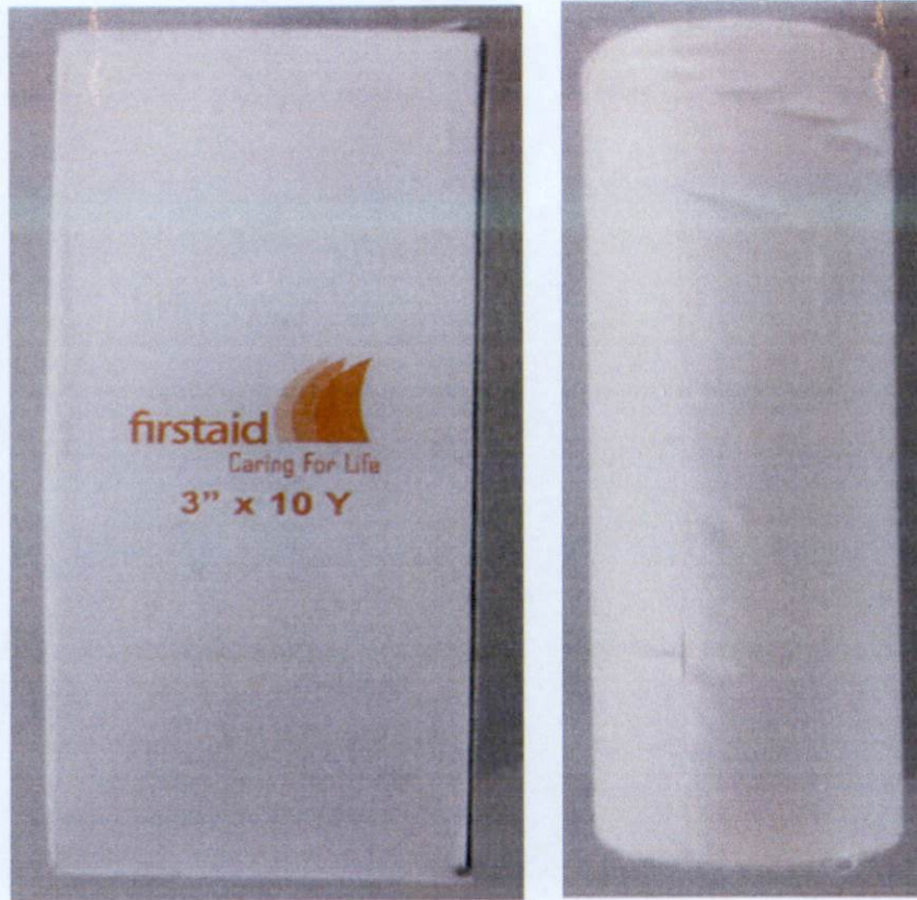
Figure 2. Unnotified Firstaid Caring For Life 3" x 10 Y