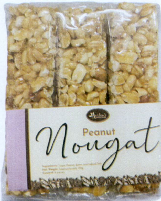
Figure 1. Unregistered LAILEN'S PASTRIES Peanut Nougat

The Food and Drug Administration (FDA) warns all healthcare professionals and the general public NOT TO PURCHASE AND CONSUME the following unregistered food products: