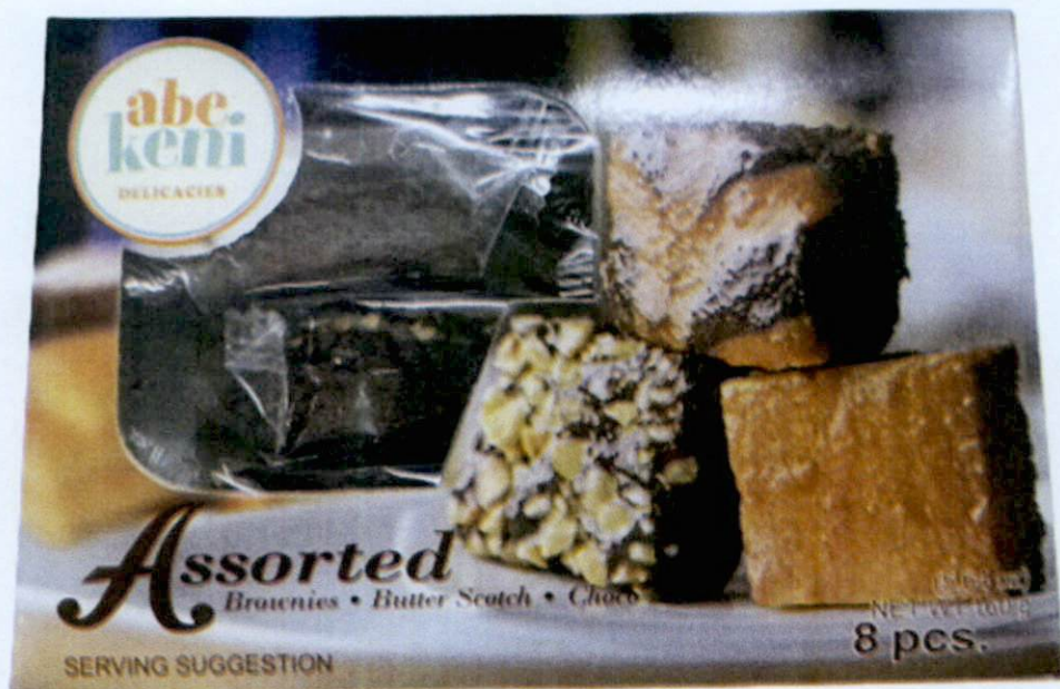
Figure 3. Unregistered ABE KENI DELICACIES Assorted Brownies, Butter Scotch, Choco