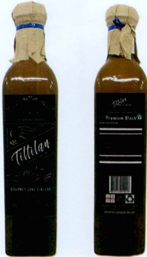
Figure 2. Unregistered TILTILAN Premium Black Gourmet Cane Vinegar